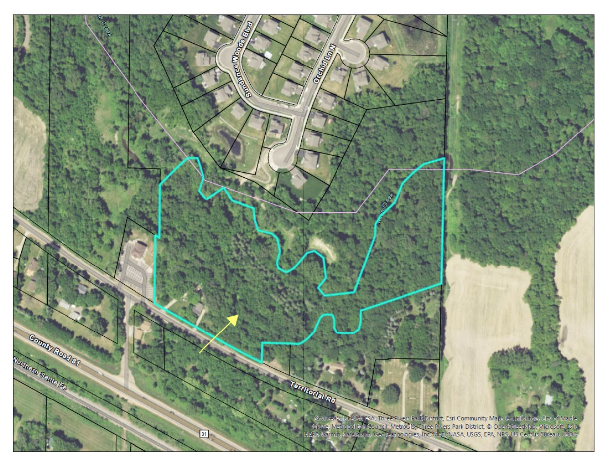
Figure 4. Image of the subject property.