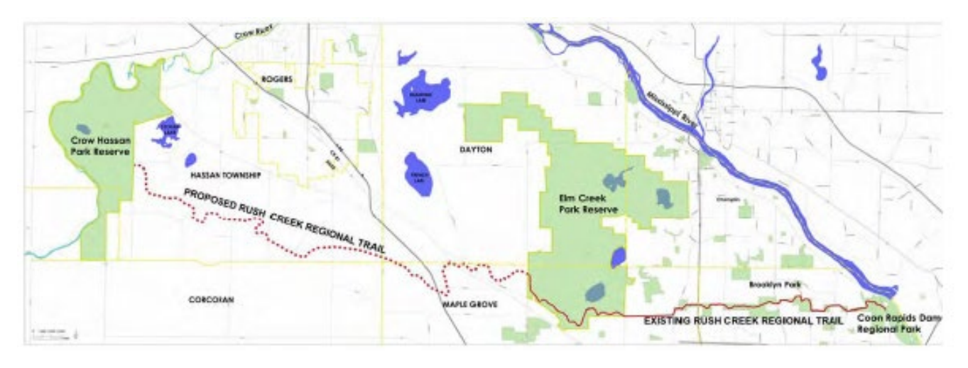
Figure 3. Close-up map of a portion of the Rush Creek Regional Trail, with the approximate location of the subject property circled in red.

Figure 2. Excerpt from the Rush Creek Regional Trail long-range plan showing the built trail from Elm Creek Park Reserve east to the Mississippi River and the planned trail west of Elm Creek Park Reserve to Crow Hassan Park Reserve (please note that the Coon Rapids Dam Regional Park is now called the Mississippi Gateway Regional Park).