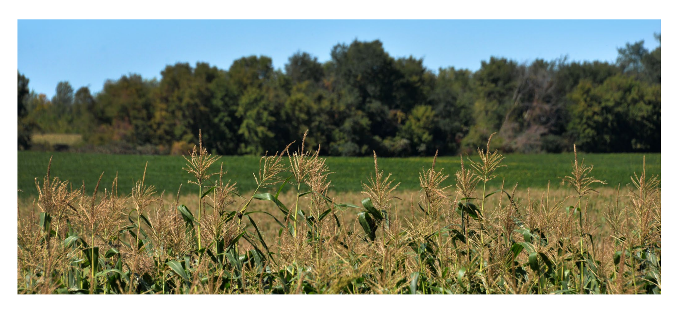
Page - 3 | METROPOLITAN COUNCIL

The report summarizes program enrollment as of December 31, 2018. The Metropolitan Council has monitored the program's participation since 1982 and has prepared annual reports to the Minnesota Legislature summarizing participation in the program and providing maps illustrating lands enrolled in the program.