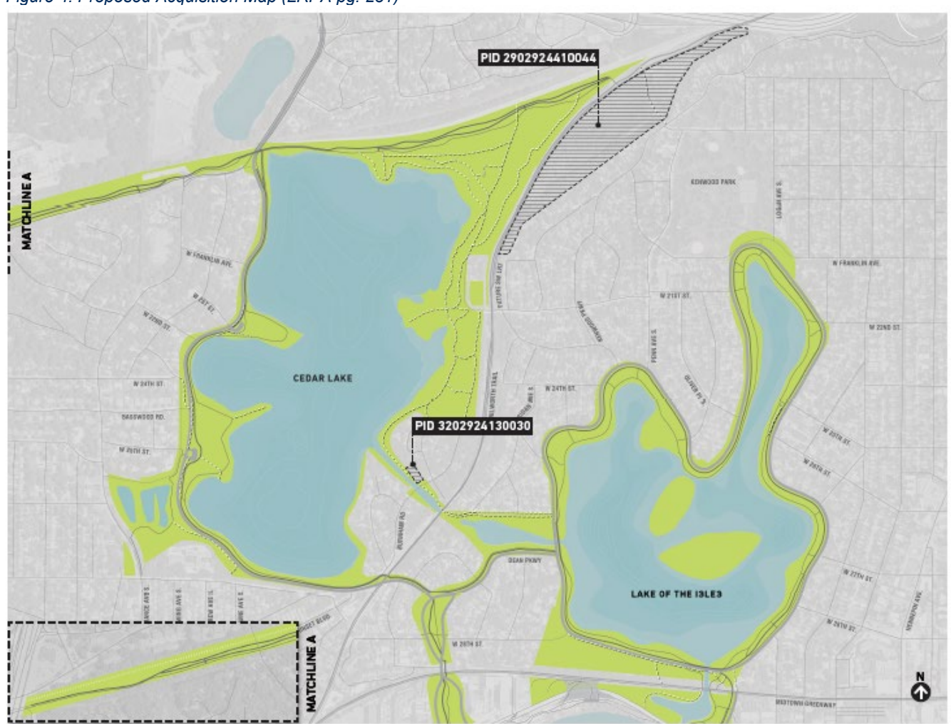
Figure 4: Proposed Acquisition Map (LRPA pg. 231)

The Cedar-Isles project area includes Cedar Lake and the surrounding parkland, Lake of the Isles and the surrounding parkland, the Kenilworth Channel that connects both lakes, Dean Parkway, and a portion of the Cedar Lake Regional Trail (Figure 4)