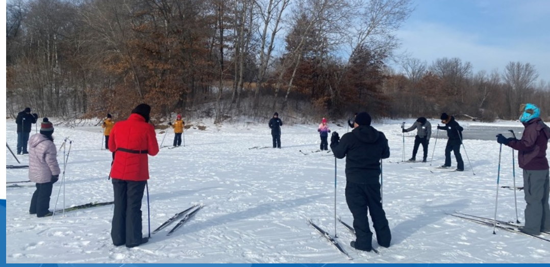
Learn to Ski with Outdoor Latino, Dakota County