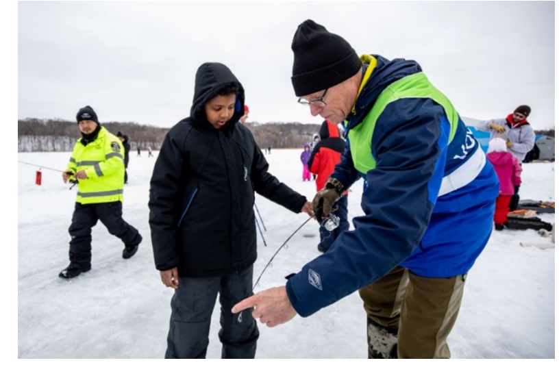
Fish Lake Regional Park