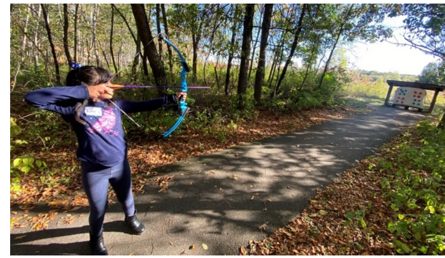
Archery in the Parks, Dakota County