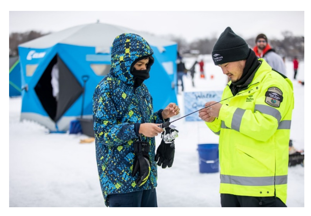
Try It Ice Fishing, Fish Lake Regional Park Three Rivers Park District