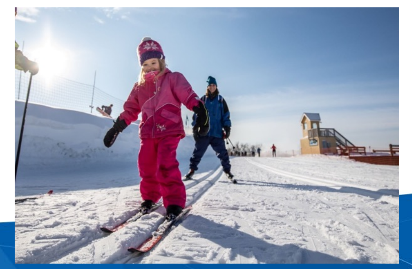
Nordic Opener, Elm Creek Park Reserve Three Rivers Park District