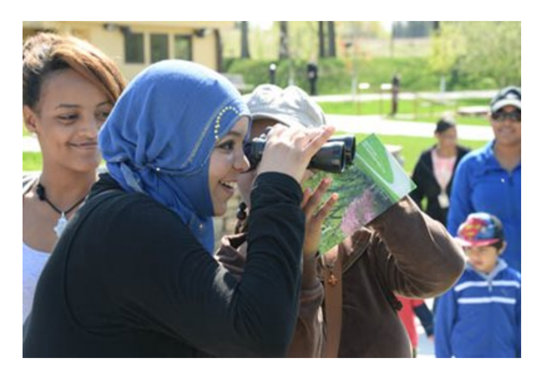
Youth engagement in Dakota County Parks