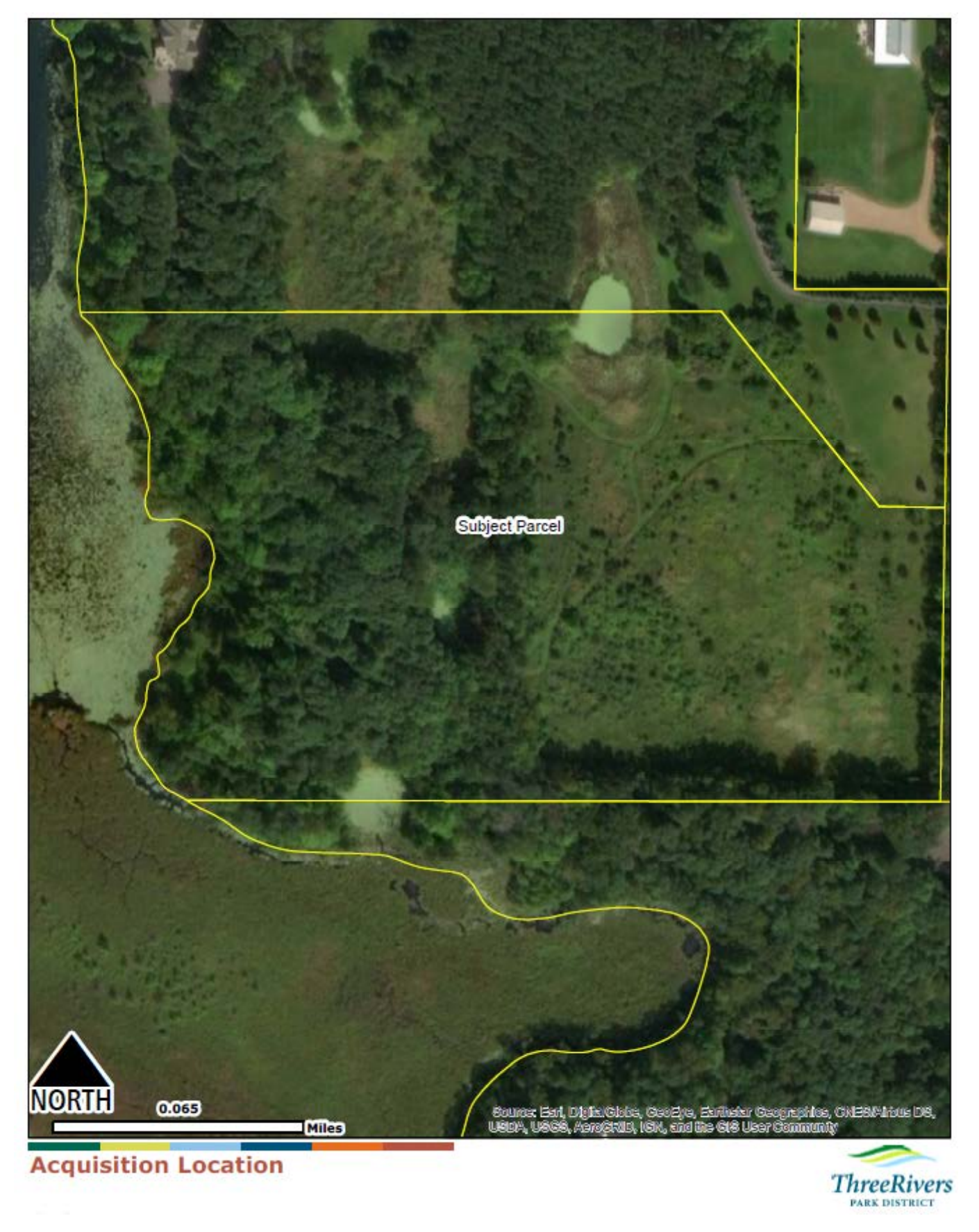
Figure 2. Map of subject parcel