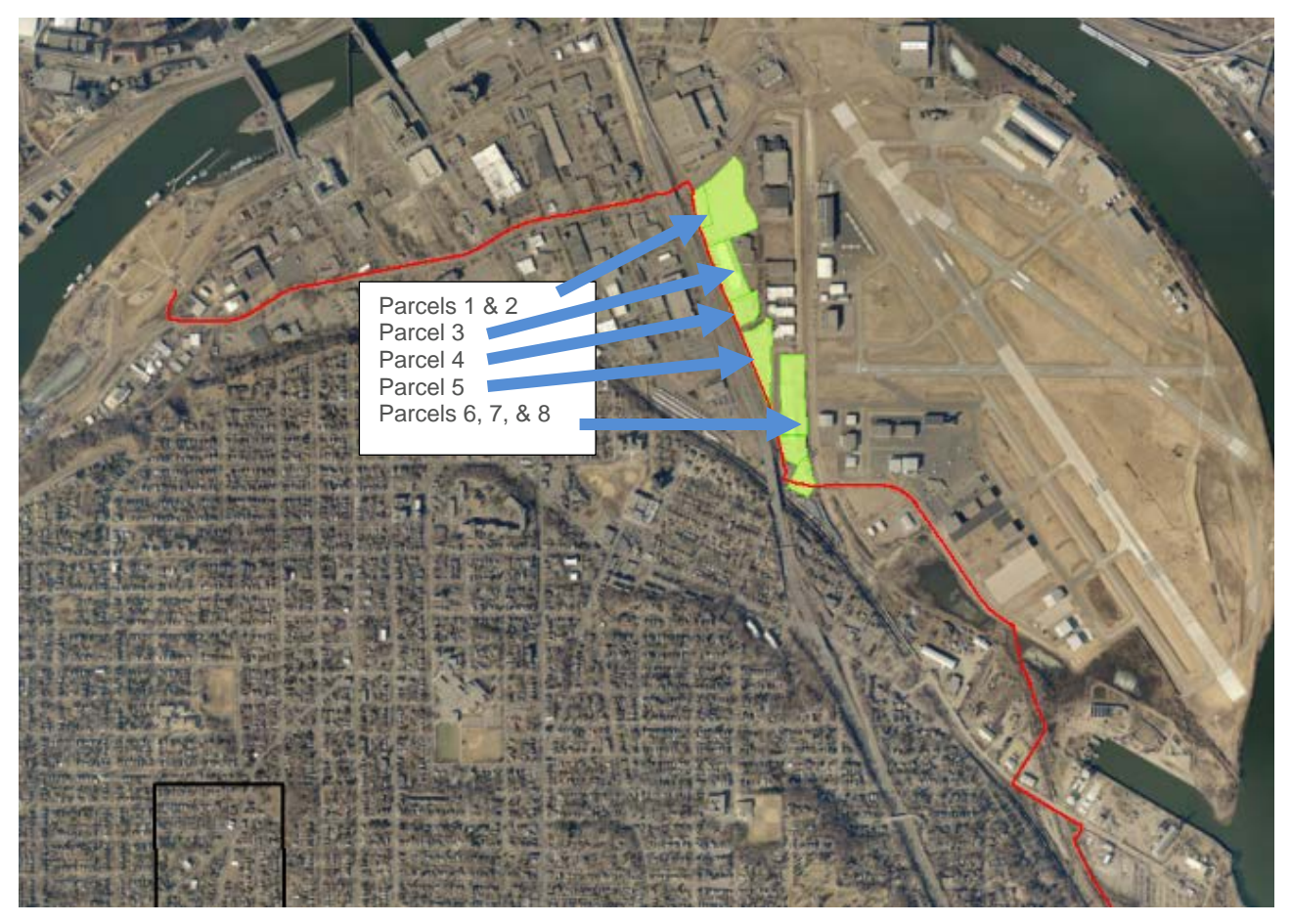
Figure 1: Robert Piram Regional Trail alignment and easement locations