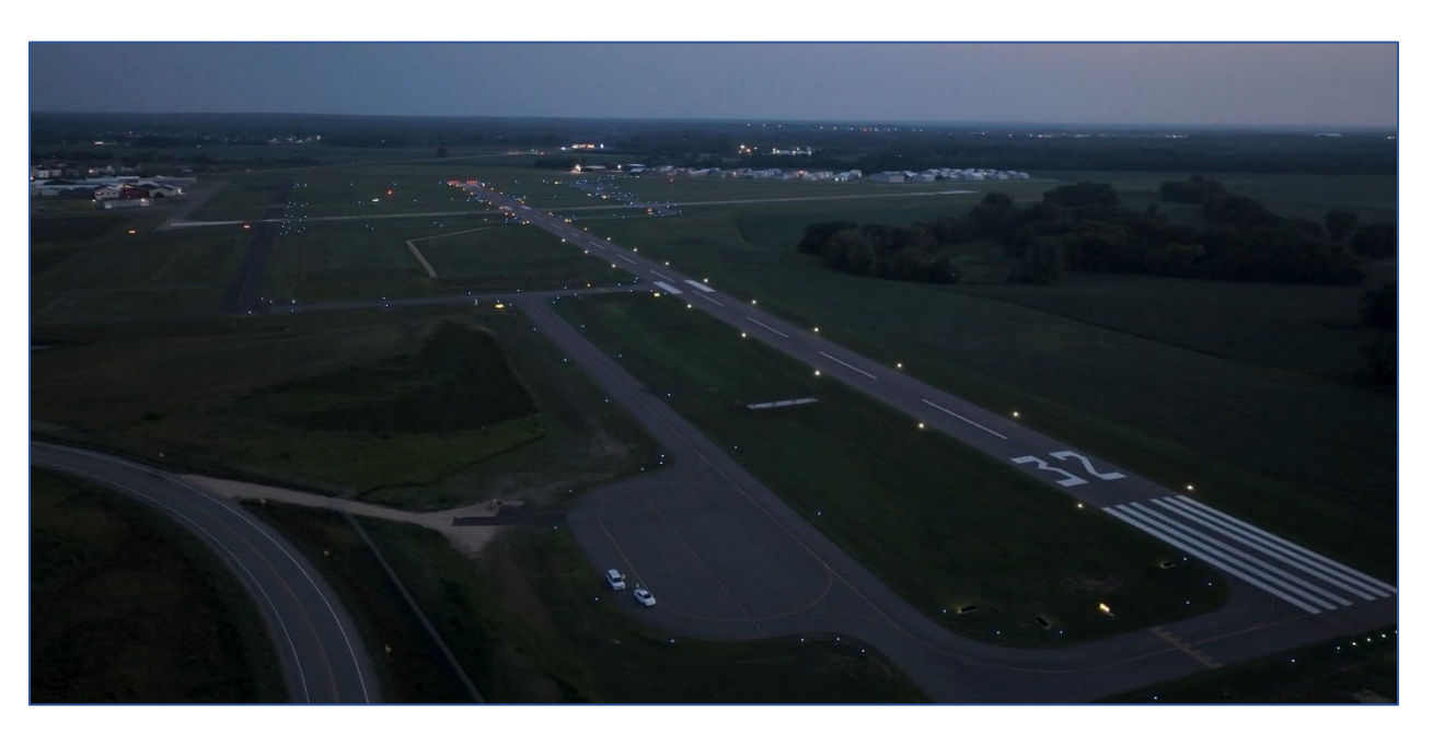
An early evening view of the realigned Runway 14-32

In September 2016, the MAC adopted the 2035 LTCP. Like previous plans, the LTCP objectives included improving runway safety in compliance with FAA guidelines, providing appropriate facilities for the aircraft types currently utilizing the airport, and delineating the future footprint of the airfield pavements.