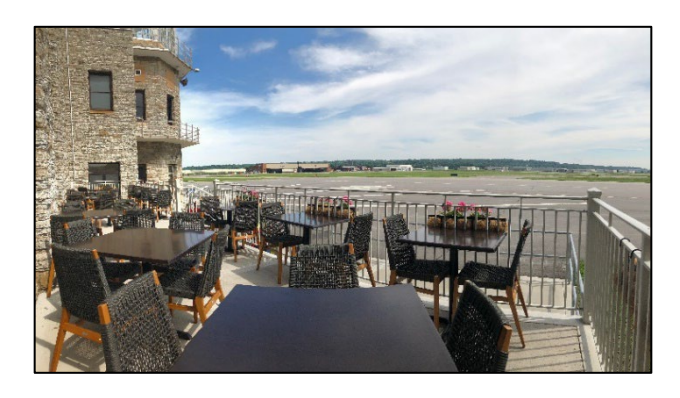
St. Paul Downtown Airport

On September 18, 2023, the MAC Commission adopted the Preliminary 2024–2030 CIP (shown in Appendix A). This AOEE report is prepared in accordance with the requirements of Minnesota Statutes Section 473.614, as amended in 1988 and 1996. It presents an assessment of the potential environmental effects of projects in the MAC preliminary seven-year CIP from 2024 to 2030 for each MAC-owned airport. Under Minnesota law, the MAC is required to "examine the cumulative environmental effects at each airport of projects at that airport (in the seven-year CIP), considered collectively."