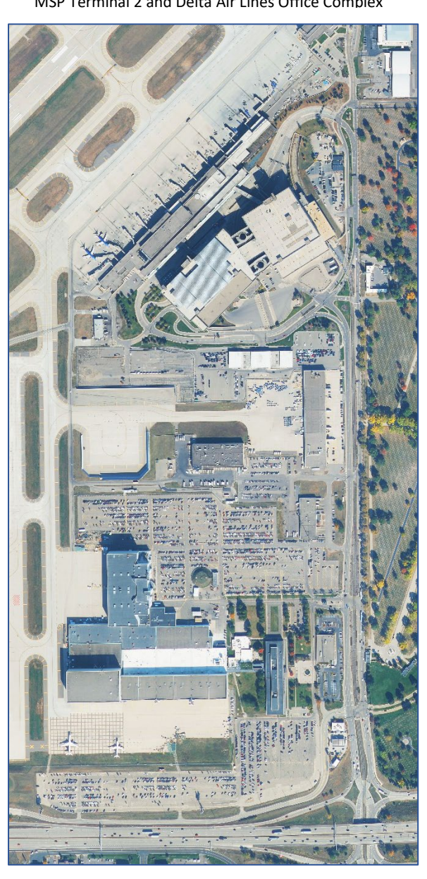
MSP Terminal 2 and Delta Air Lines Office Complex

This AOEE report analyzes each airport in the order in which the projects are presented in the CIP. Appendix A lists all projects included in the preliminary seven-year CIP (2024–2030). The notes in the table explain the type of work for each proposed project and why the work may or may not have a potential effect on the environment. Appendix B provides a more detailed description for each project included in the first year (2024) of the preliminary CIP. Appendix C includes a draft description for projects in years 2025 through 2030 that meet the above three conditions in Minnesota Statutes Section 473.614 for a mandatory EAW.