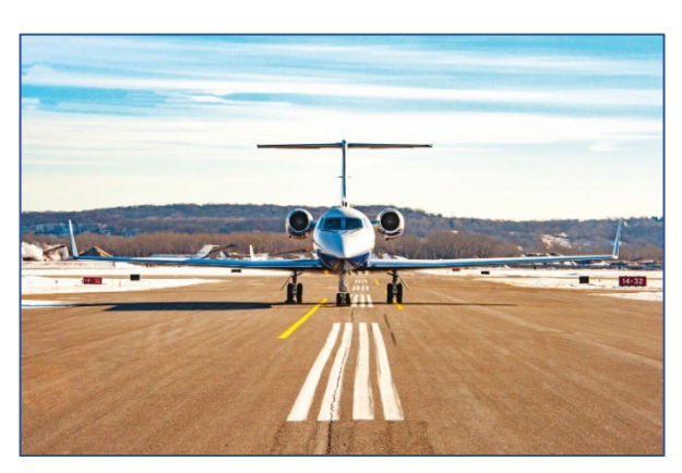
St. Paul Downtown Airport

The last Long-Term Comprehensive Plan (LTCP) for STP was adopted by MAC in June 2010 and covered the 2010-2030 timeframe. No major projects or improvements have been planned for STP aside from pavement reconstruction and upgrades to existing MAC-owned buildings. While the anticipated timeline for kicking off the 2040 study has been postponed beyond 2023, MAC is currently planning to initiate the next update to the LTCP in 2024.