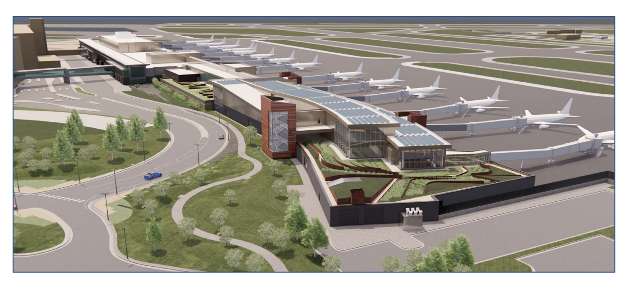
MSP T2 North Gate Expansion Rendering

This project will expand Terminal 2 to the north, adding passenger boarding bridges, gate hold seating, concessions, and support spaces. The project includes relocation of the existing loading dock facilities as well as an expansion of the power and conduit feeds to provide enhanced redundant electrical services to the terminal. This project is aiming for LEED Gold certification, with solar-ready roof structures, green roof installations, geothermal systems, and mass timber ceiling construction.