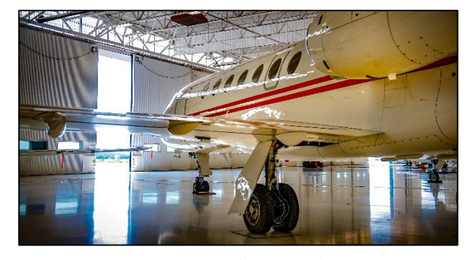
Corporate Hangar at Anoka County-Blaine Airport

Although some of the projects at ANE may have temporary impacts during construction, the MAC will use mitigation measures during construction to minimize potential adverse effects such as noise, dust, and erosion. The environmental effects of construction are temporary, will be minimized using conventional mitigation measures and best management practices, and do not constitute long-term cumulative potential effects when combined with other projects at ANE.