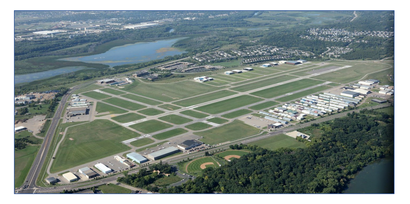
Flying Cloud Airport

MAC is currently preparing a 2040 long-term plan for Flying Cloud. As a part of that process, MAC is holding numerous stakeholder engagement and public information meetings. The long-term plan update is scheduled for completion in 2024.