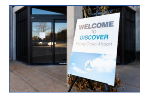
Flying Cloud Airport