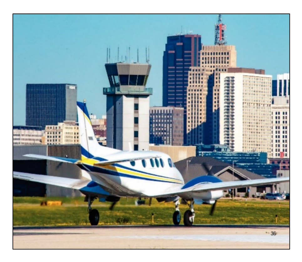
St. Paul Downtown Airport

None of the proposed projects listed in the preliminary 2024-2030 CIP meet the threshold in Minnesota Statutes Section 473.614 for an EAW. Although some of the STP projects may have temporary impacts during construction, the MAC will use mitigation measures during construction to minimize potential adverse effects such as noise, dust, and erosion. The environmental effects of construction are temporary, will be minimized using conventional mitigation measures and best management practices, and do not constitute long-term cumulative potential effects when combined with other projects at STP.