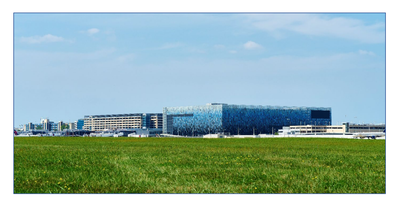
MSP New Silver Ramp with Access to Public Parking, Rental Cars and the Multi-Modal Transit Hub (shuttle, bus, LRT, bike, and walkway to hotel)

In 2022, the MAC marked the 60<sup>th</sup> anniversary of the MSP's Terminal 1. The original building, with its open plan, long span concrete shell and signature folded ("wavy") roof, was heralded in 1962 as a landmark event that would modernize the travel experience. Originally designed to accommodate 1.8 million passengers annually, Terminal 1 has undergone numerous renovations and additions over the past six decades. The building has grown by more than 2.4 million square feet and now hosts tens of millions of passengers each year.