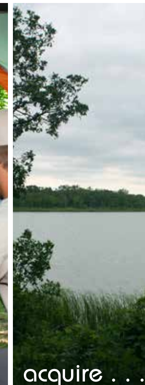
Bertram Chain of Lakes acquisition