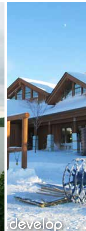
Tettegouche Visitor Center