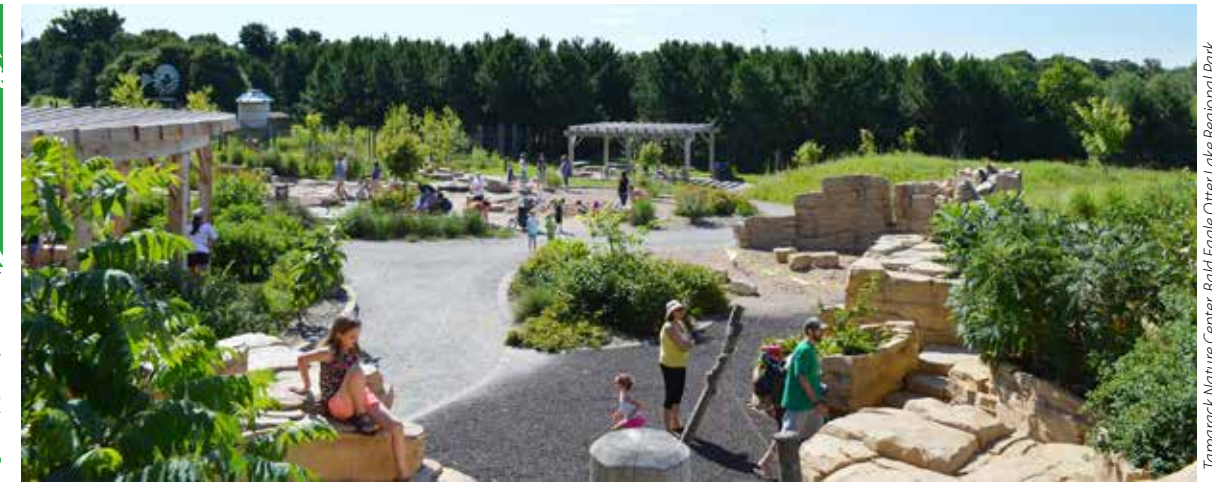
Tamarack Nature Center, Bald Eagle Otter Lake Regional Park