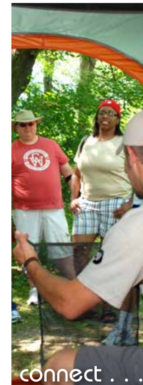
"I Can Camp!" skill building program