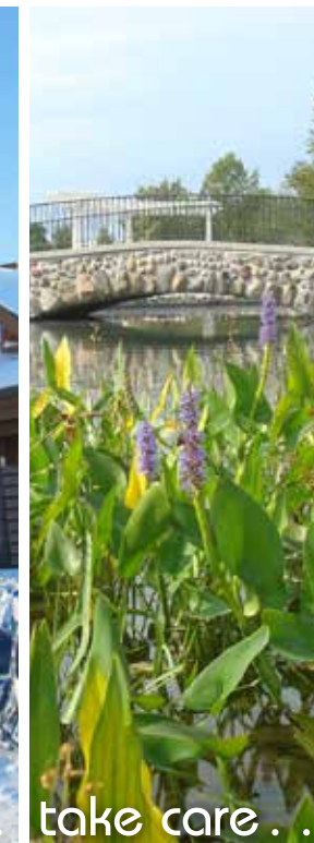
Como Regional Park Lily Pond