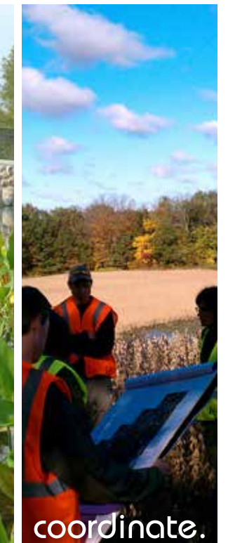
Citizen-county design committee

Get Involved, Learn More, or Spread the Word, Visit: http://www.legacy.leg.mn/ptlac Metropolitan Area: www.Metrocouncil.org/parks/publications-resources.aspx Greater Minnesota: www.Legacy.leg.mn/gmrptc Department of Natural Resources: www.dnr.state.mn.us/legacy/index.html