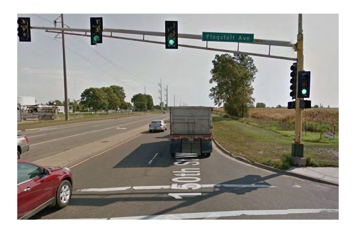
CSAH 42 facing east at proposed underpass location