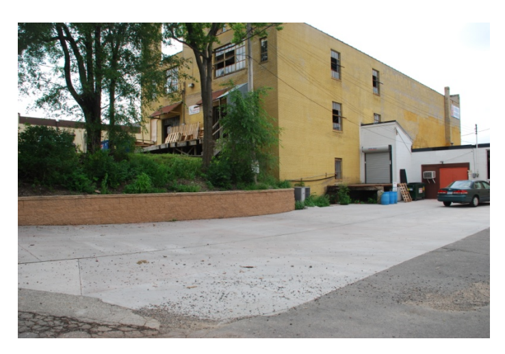
City of St. Paul Neighborhood Commercial Parking Program funds used to build a retaining wall and parking lot for Design Press at 2447 University Avenue

To date, the City of St. Paul HRA has approved $1,325,000 in funding for 24 parking improvement projects. One project has dropped out (750 University), and 5 projects have been completed or mostly completed (860-866, 904-908, 133-1142, 1159, and 2447 University). Approximately 50 applications were received by the City during the time that applications were being accepted. A complete list of projects funded to date can be found as Attachment C. During the month of July, geotechnical (soil conditions) investigations were completed for the projects being completed at the northeast Snelling Avenue intersection and at the Southeast St. Albans intersection.