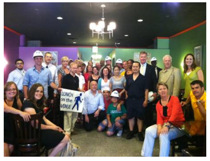
Lunch on the Avenue event – promoting local restaurants during construction.

<u>Social Media</u>: CCLRT Outreach and Communications Staff uses Twitter to send press releases, newsletters, and weekly construction updates to the public. At the end of July @cclrt had 971 followers.