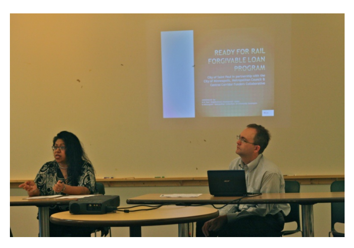
U7 presents information on the Business Support Fund to Central Corridor businesses

University Avenue Business Preparation Collaborative (U7): The University Avenue Business Preparation Collaborative (U7) was created by community development organizations to provide marketing support, on-site business consulting, resource center and planning center, small business workshops, grants for marketing and façade improvements, microlending and financing support to small businesses along the Central Corridor. All funds reported in the Business Impacts SEA for this activity have been disbursed.