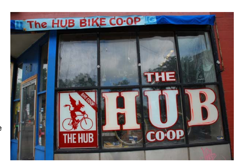
The Hub Bike Co-op at 301 Cedar Avenue used a grant through the City of Minneapolis Great Streets Façade Improvement Program to install new windows