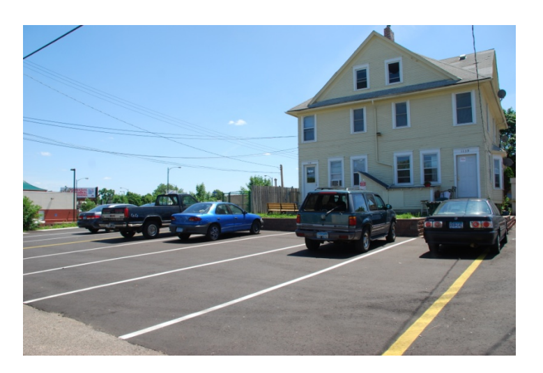
Parking Improvement behind three buildings at 1133 to 1141 University Avenue

To date, the City of St. Paul HRA has approved $1,325,000 in funding for 24 parking improvement projects. One project has dropped out (750 University), and 5 projects have been completed or mostly completed (860-866, 904-908, 133-1142, 1159, and 2447 University). Approximately 50 applications were received by the City during the time that applications were being accepted. A complete list of projects funded to date can be found as Attachment C. During the month of July, geotechnical (soil conditions) investigations were completed for the projects being completed at the northeast Snelling Avenue intersection and at the Southeast St. Albans intersection.