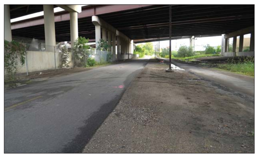
10. Trails passing under I-94, looking east.