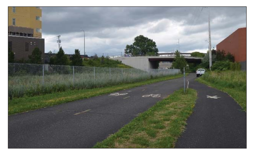
11. Looking east at Glenwood Ave. bridge, Target Field in background.