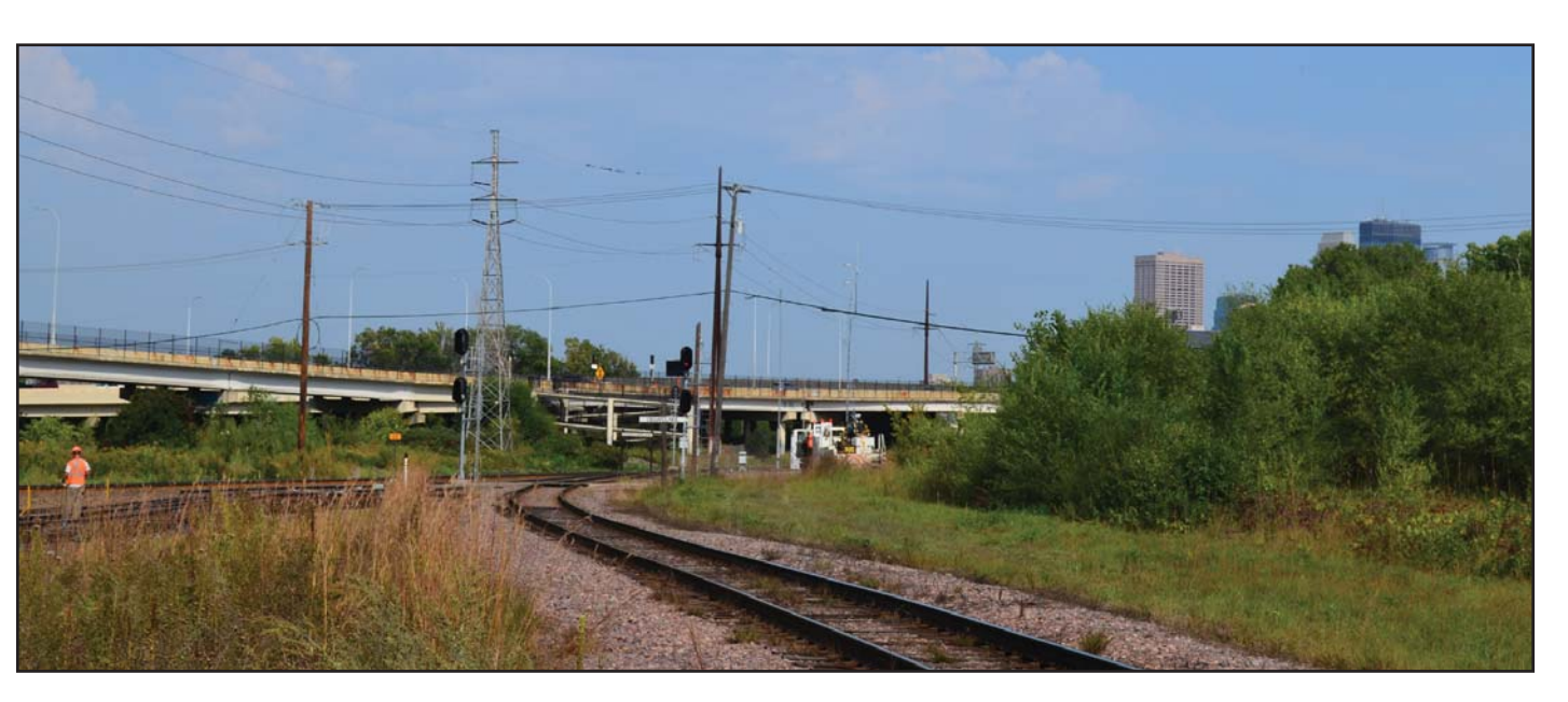
Above: Active freight rail tracks near Penn Avenue.