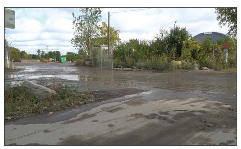
8. Entrance to Linden Yards in eastern portion, looking east.