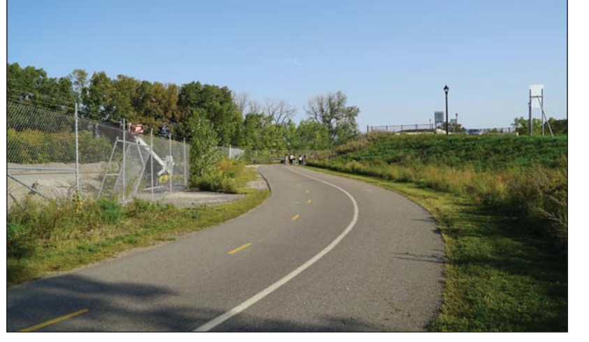
7. Trail near Bassett Creek Valley Station site, looking east.