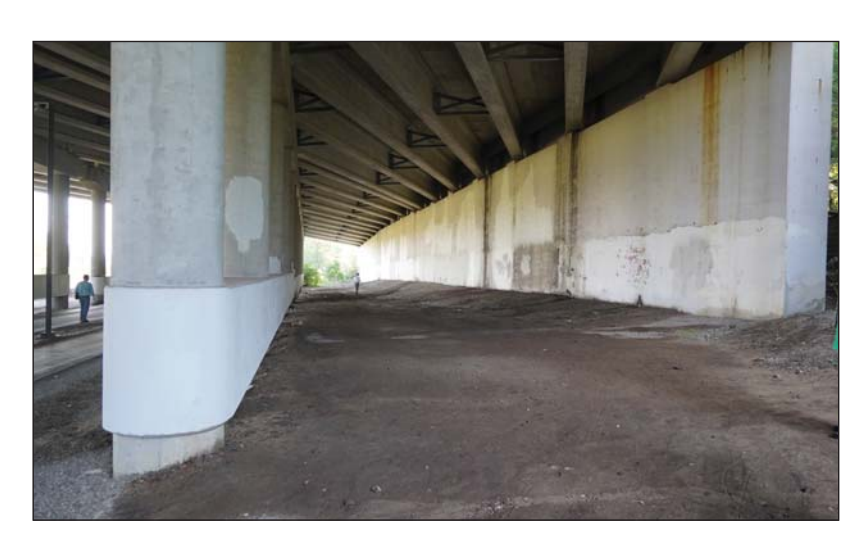
3. Cedar Lake Trail under I-394, looking east.