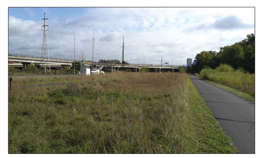
1. Bryn Mawr Station area, looking east along the Cedar Lake Trail.