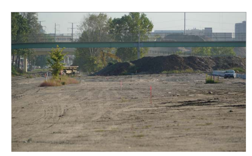
5. Undeveloped land in the western Linden Yards and trail overpass, looking east.