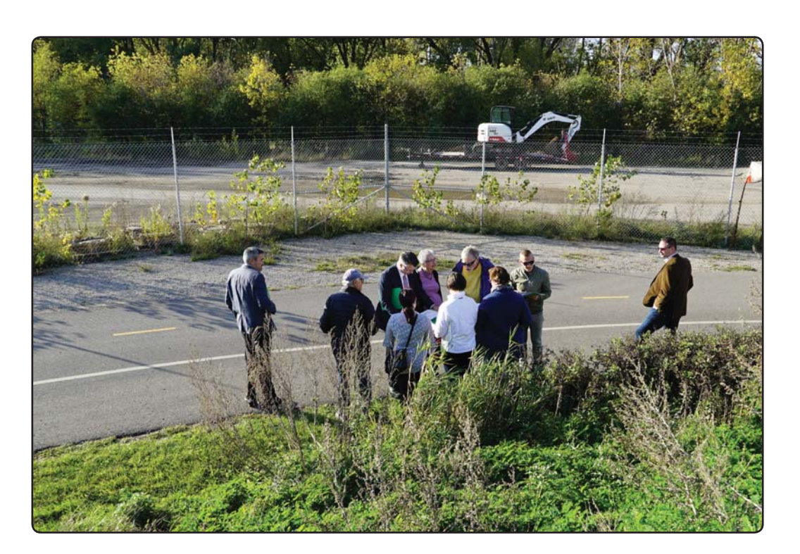
Members of the Working Group discuss design alternatives with Southwest LRT Project staff during a tour of the corridor protection area.

These events will provide details about the proposed corridor protection wall, general project information, and opportunities to give feedback.