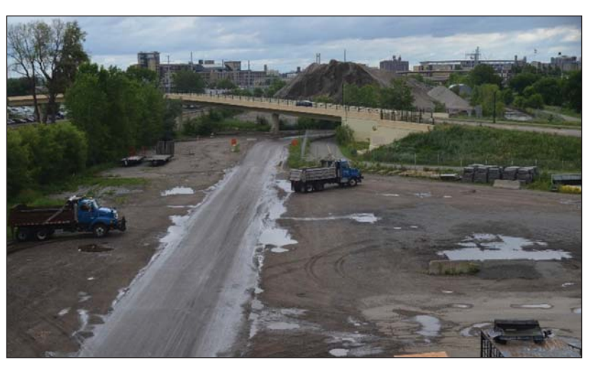
6. Looking east toward Van White Memorial Boulevard from trail overpass.