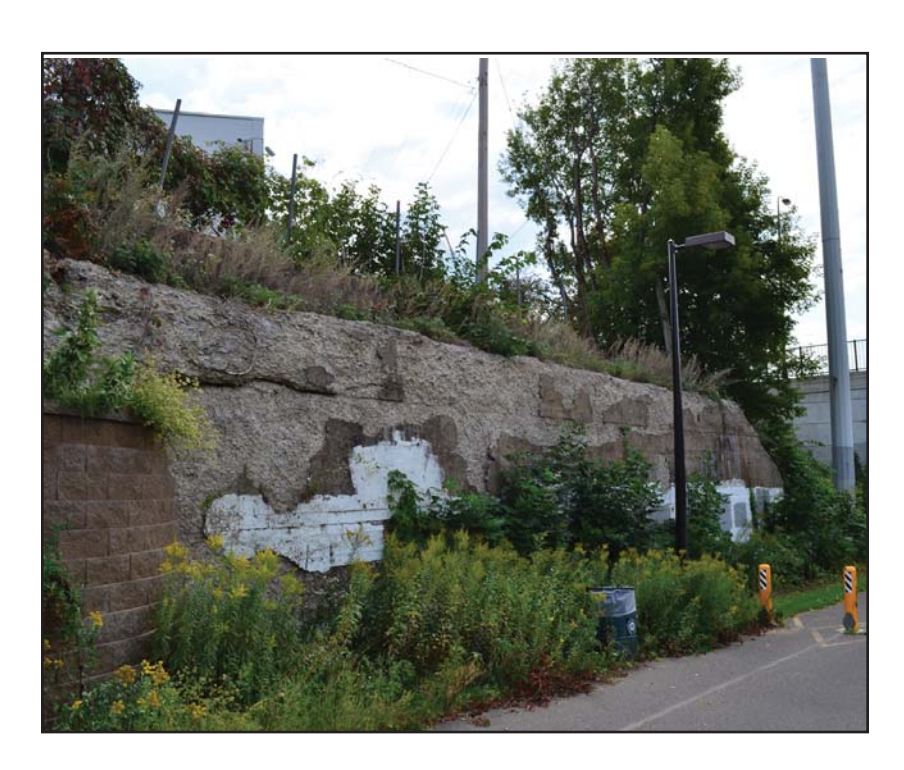
Left: Remnants of a historic masonry retaining wall in the corridor protection area.

The Federal Transit Administration has determined the proposed Project design modifications will have an adverse effect on the railroad historic district. Consultation is in process to resolve the adverse effect through minimization and mitigation.