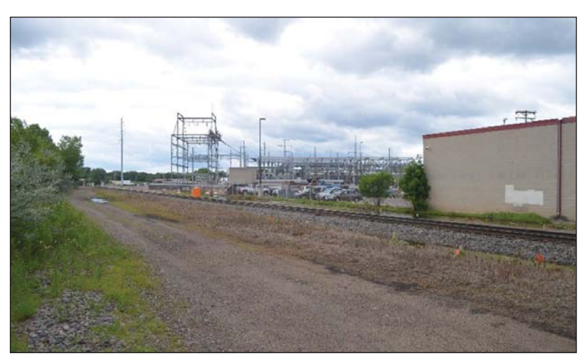
9. Industrial land along trail between Linden Yards and I-94, looking west.