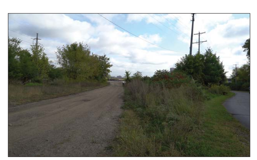
4. Linden Yards West, looking east: Trail and proposed wall diverge in this area.