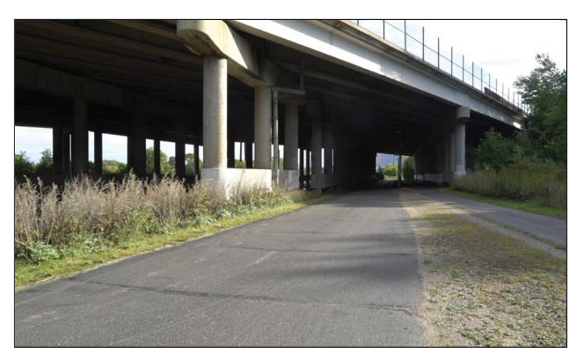
2. Looking east along the Cedar Lake Trail as it passes under I-394.