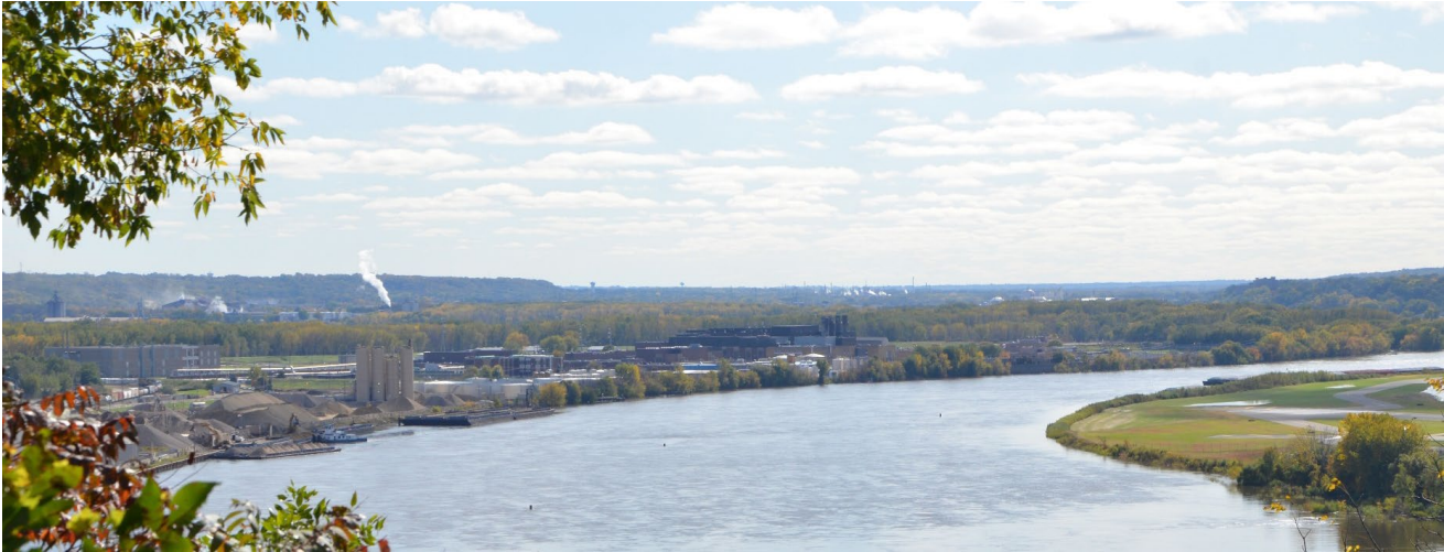
View of Metropolitan Wastewater Treatment Plant (WWTP)