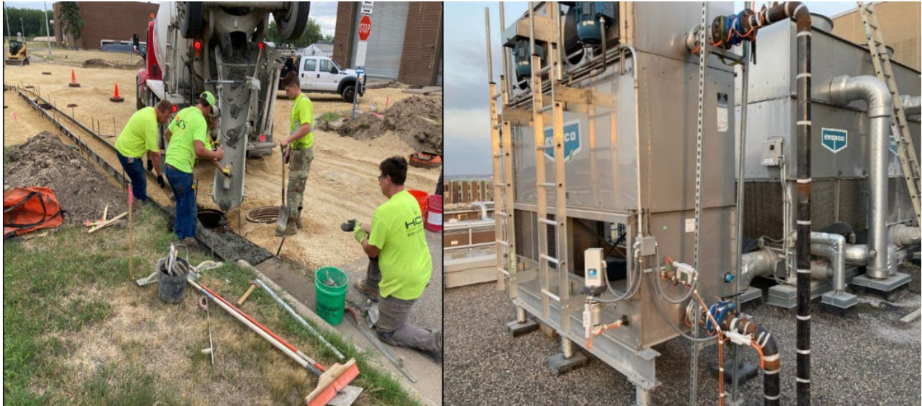
Left: 5th and 5th Road Rehabilitation; Right: Closed-loop cooling system at SMB

Project location: Council district #13, City of Saint Paul, Metro WWTP