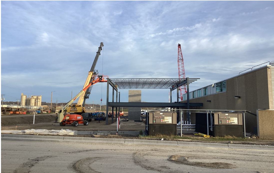
Framing the western section of the Services Building

Project location: Council district #13, City of Saint Paul, Metro WWTP