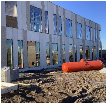
Area A – Exterior window glass installation

Pile driving is expected to begin on Area E—Guard Station in March.