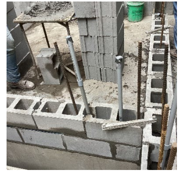
Area D – Stairwell masonry wall