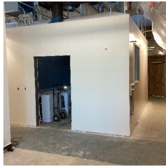
Area B – Laboratory Core Area