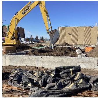
Area C – Grade beam backfill