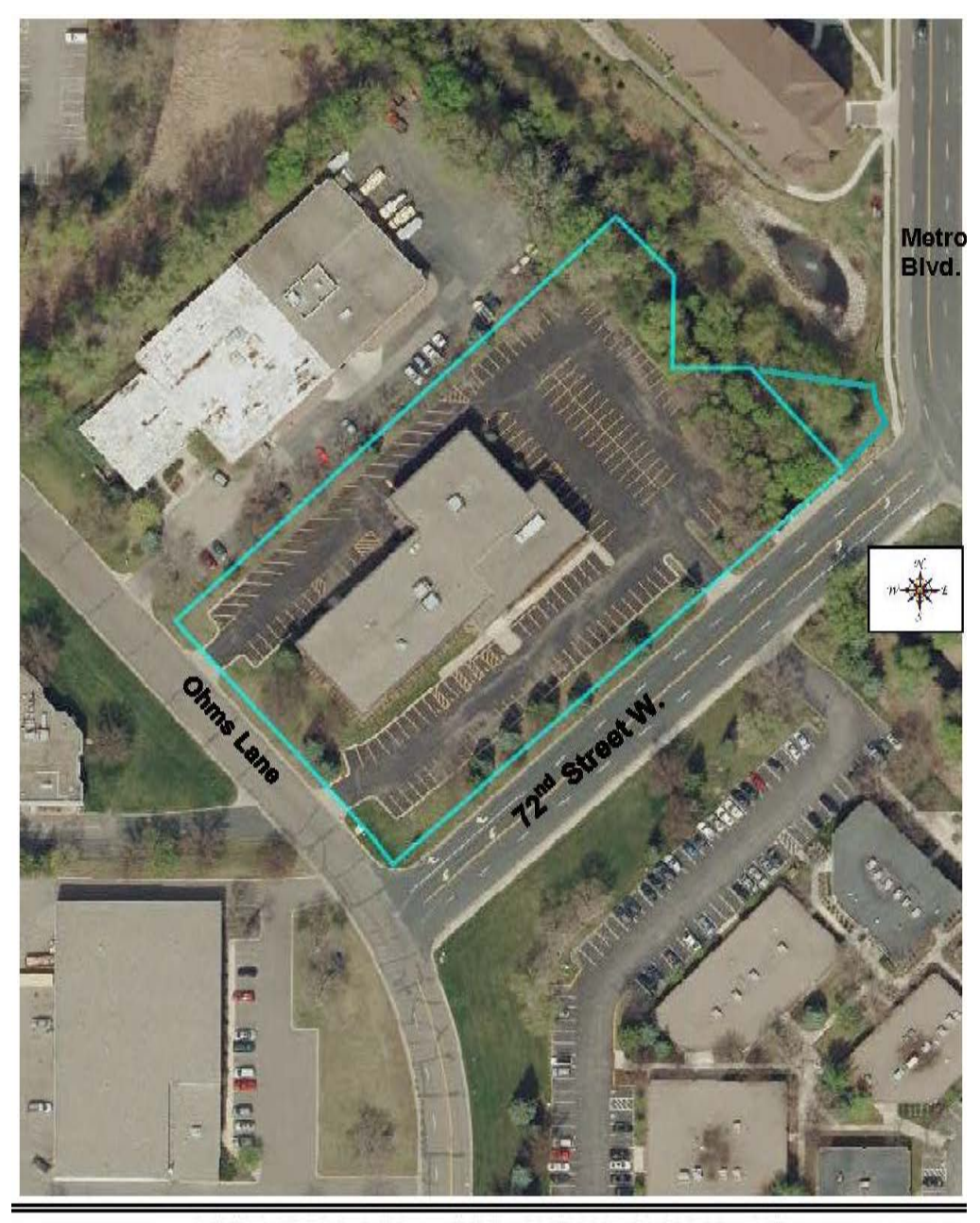
SUBJECT AERIAL PHOTOGRAPH