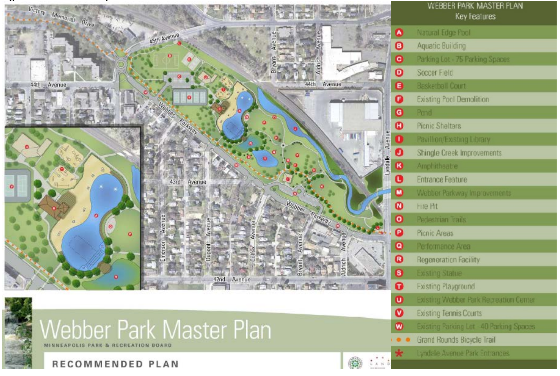
Figure 5: Master site plan for Webber Park