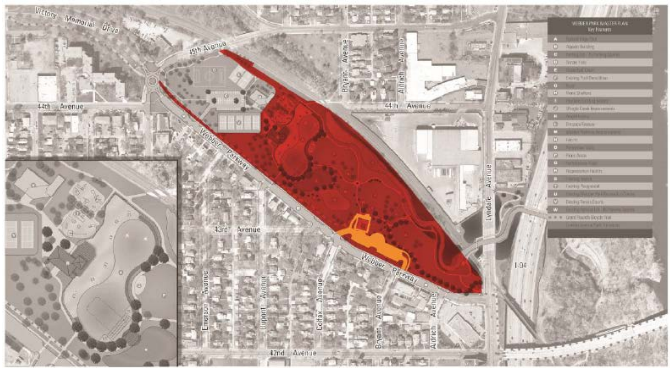
Figure 3: Proposed boundary expansion and easement area

2. Demand Forecast: The expansion of North Mississippi Regional Park will provide continuous regional trail connections, swimming facilities and picnicking opportunities. Trails within Webber Park facilitate continuous connections between Shingle Creek Regional Trail, Victory Memorial Parkway Regional Trail, St. Anthony Parkway Regional Trail and North Mississippi Regional Park. These facilities had the following estimated visits in 2011: