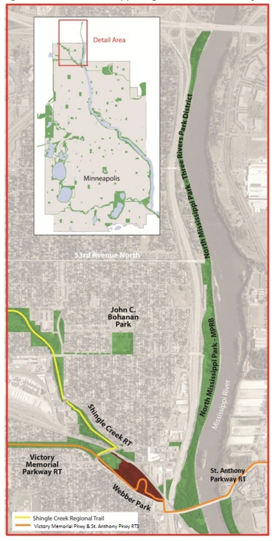
Figure 1: North Mississippi Regional Park Boundary and Expansion Area

Figure 1 shows the boundary of North Mississippi Regional Park; the portion of Webber Park being added to the boundary is shown in brown.