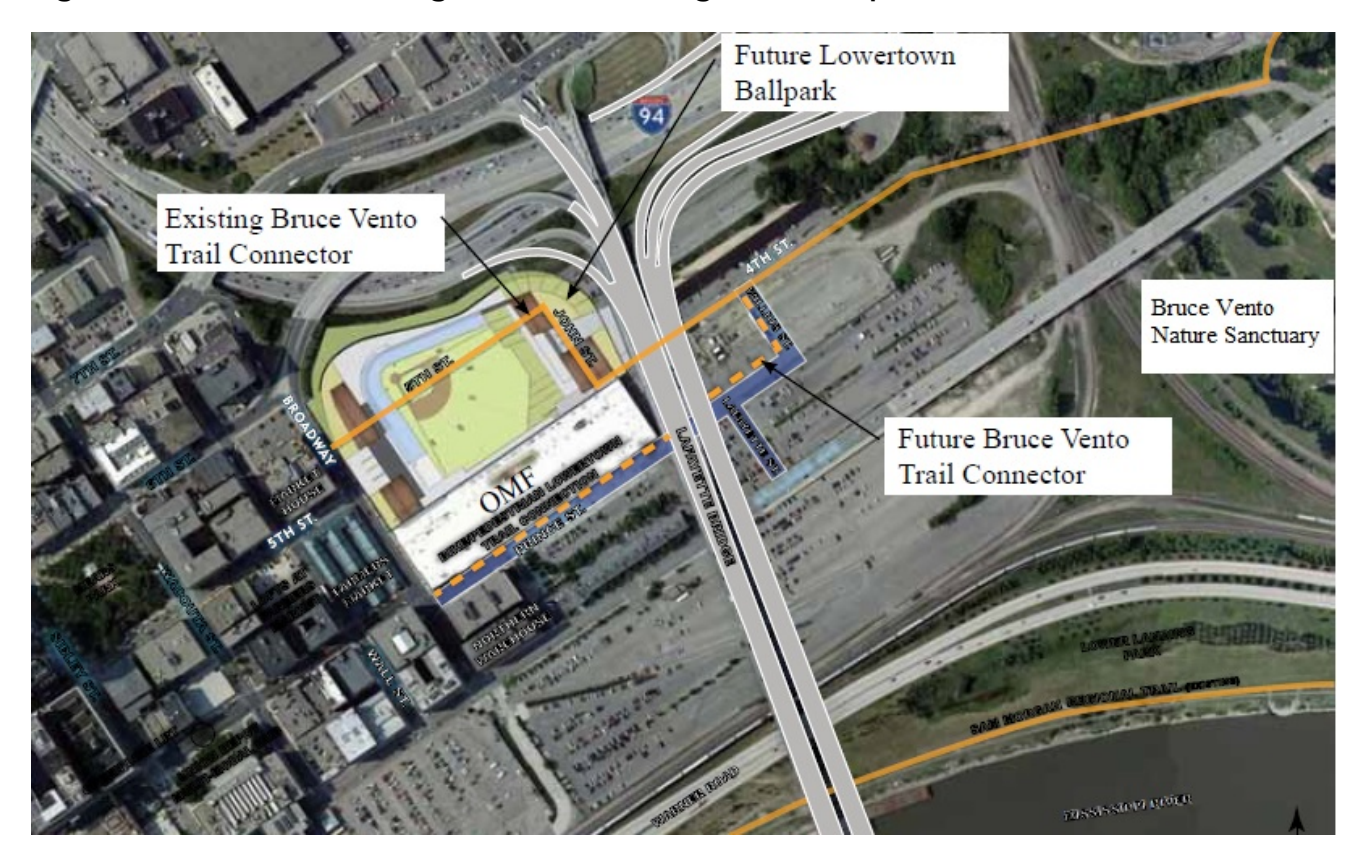
Figure 1: Bruce Vento Regional Trail Realignment Map

The Metropolitan Council has committed to dedicating right-of-way at no cost to the City of St. Paul for the construction of Willius Street, the northern portion of Prince Street and the regional trail realignment. The City of St. Paul acquired easements over three properties for the southern portion of Prince Street. Figure 2 shows the relationship between the regional trail and property ownership in the area. The area in yellow and labeled as 3 on Figure 2 is owned by the Metropolitan Council. The Green Line OMF is located on the portion of that property west of the Lafayette Bridge. The regional trail realignment is shown by the dashed black line on the south and east sides of the property.