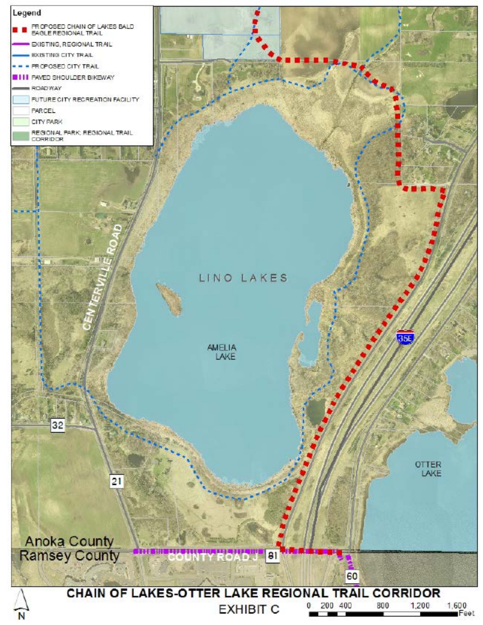
Figure 5: Southern Segment of Chain of Lakes-Otter Lake Regional Trail

Anoka County will be constructing a portion of the northern segment of the regional trail between Heritage and Dupre Streets in Centerville as part of a road reconstruction project in 2015. Any additional right-of-way needed for this segment of the regional trail will be acquired as part of the roadway project, and the County will not seek Regional Parks System funding for land acquisition.