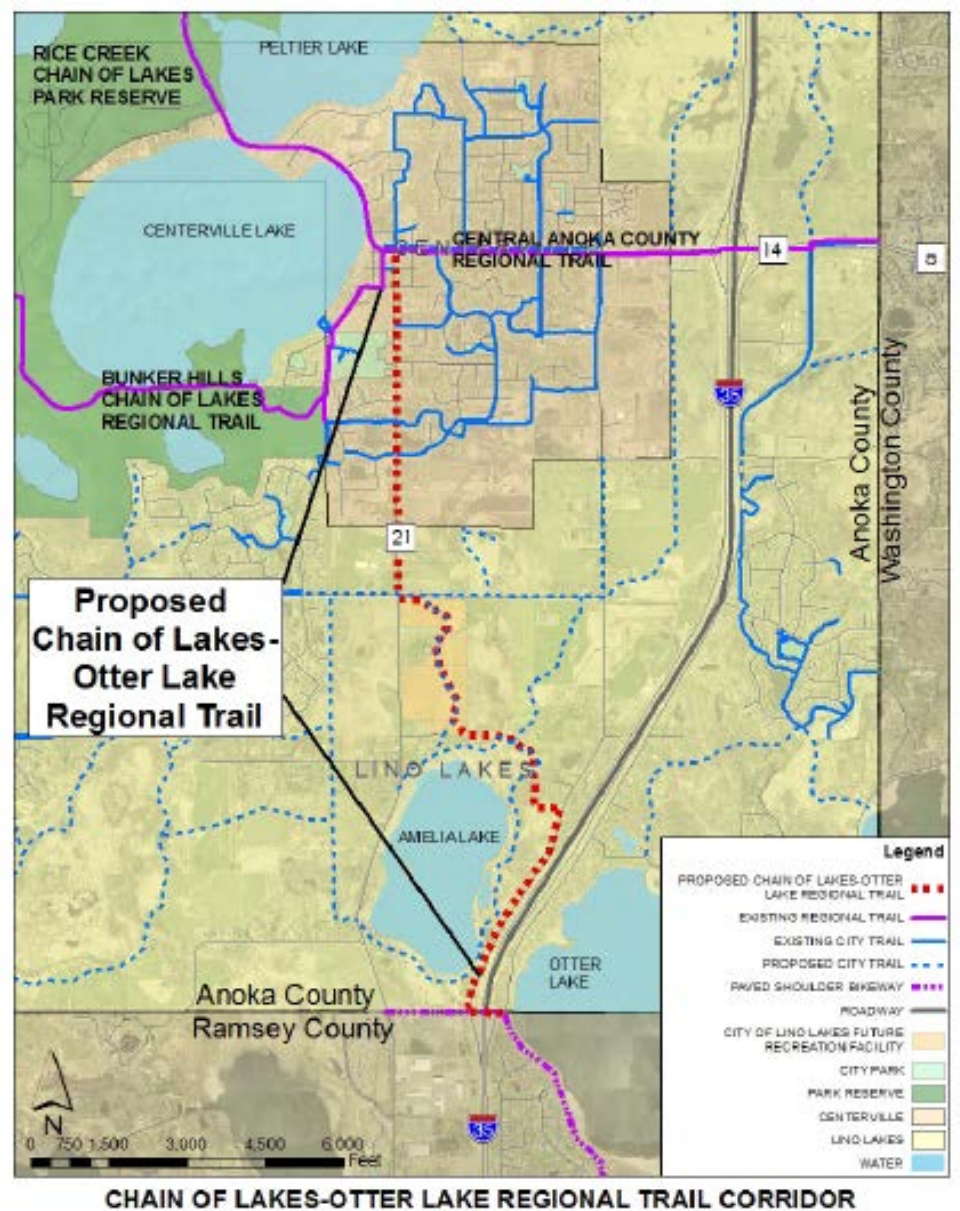
Overall Trail Corridor

The regional trail will provide connections from Rice Creek Chain of Lakes Park Reserve, the Central Anoka County Regional Trail and the Bunker Hills-Chain of Lakes Regional Trail to the Otter Lake portion of Bald Eagle-Otter Lakes Regional Park in Ramsey County. The regional trail will connect with a bikeway in Ramsey County that leads to the Tamarack Nature Center and the Birch Lake Regional Trail. The Chain of Lakes-Otter Lake Regional Trail will also connect to local parks and trails along its route.