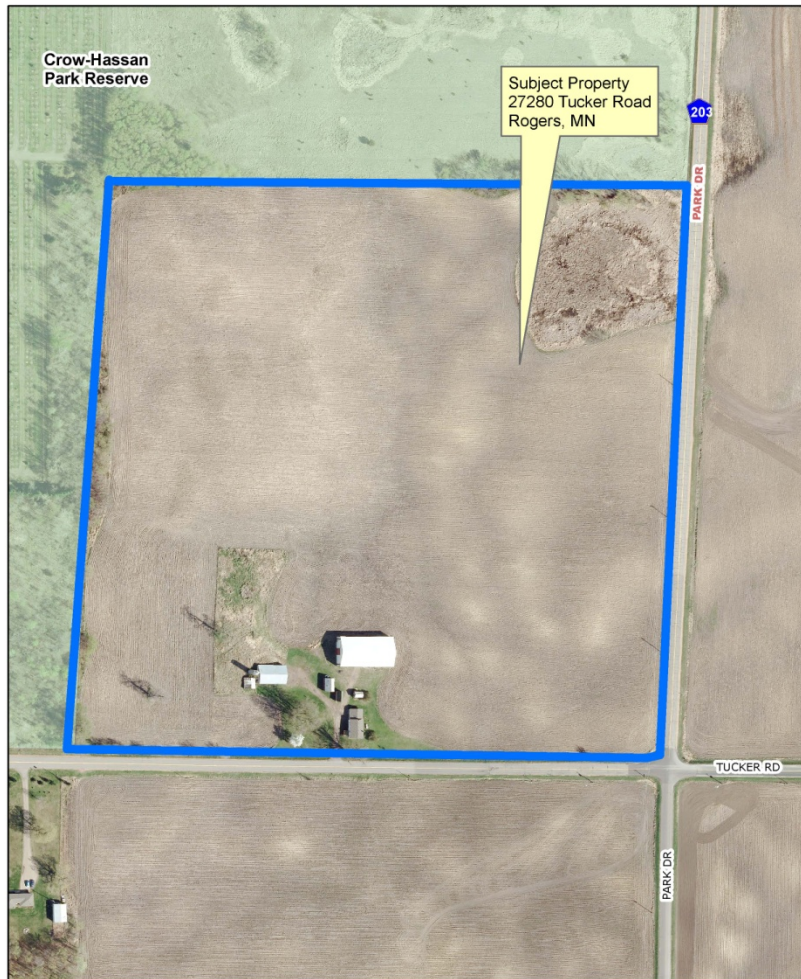
Figure 2: Crow River Park Reserve Boundary Addition parcel

The 38.56-acre property is currently in agricultural use and includes a single family residence, two pole barns and other farm-related buildings. The Park District is evaluating the two pole barns for potential future use as equipment storage for the park reserve, but will demolish the home, garage and other structures, remove the well and septic, grade and seed the site.