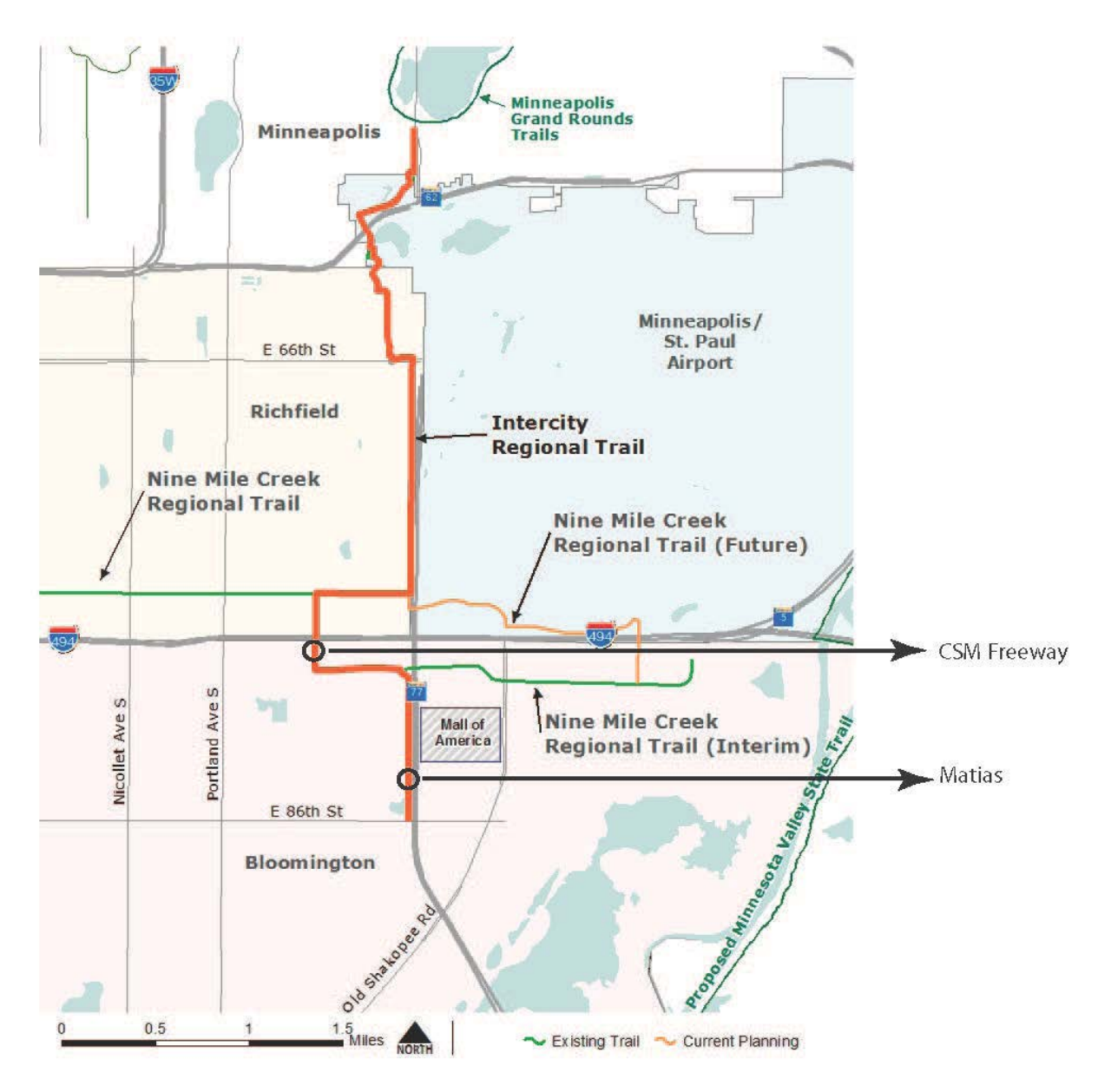
Page - 6 | METROPOLITAN COUNCIL Q:\parks\2014\May\2014-XX MPOSC TRPD ICRT Acq Grant 2 Easements May6.docx