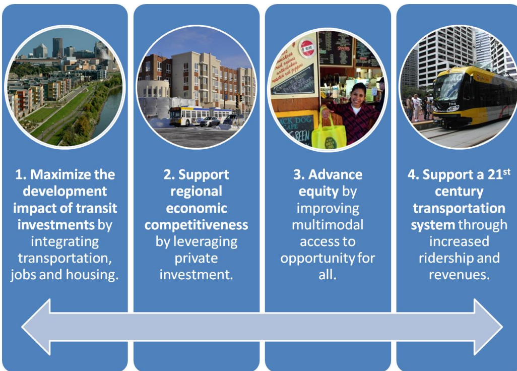
Figure 1. Metropolitan Council TOD Goals

The Metropolitan Council will advance four TOD goals: