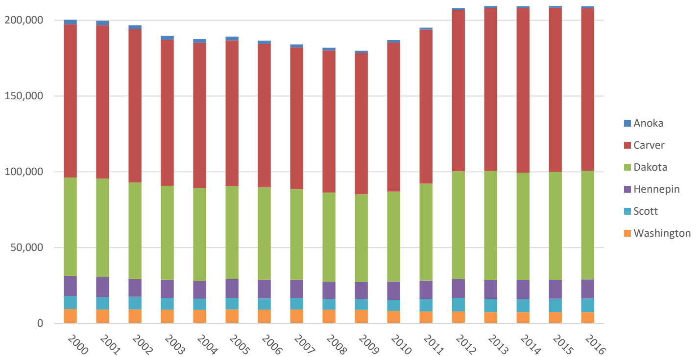
Figure 1- 2000 to 2016 Enrollment Trends (acres) by County

Table 1 shows the enrollment trends between 2000 and 2009, prior to the economic downturn. During this period, all counties experienced a decline in acres enrolled in the program. This decrease is consistent with the growing outward pressure that the region saw in development. Table 2 shows the trends since 2009, after market recovery. Carver County has seen the most substantial increase with over 14,000 acres (15%) increase in acres enrolled. Acres enrolled have increased in Dakota and Scott counties as well, with over 13,000 and 1,700 acres respectively. Anoka and Washington counties experienced a steady decline in the program since 2000, with overall 60% and 21% decreases respectively. This trend is consistent with development proposals in these counties. Ramsey County does not have any properties enrolled in the program since it is fully developed.