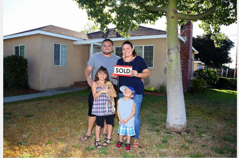
A new start for a new family