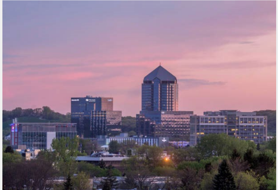
A view of Bloomington, Minnesota