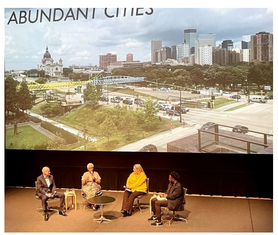
Abundant Cities - Minneapolis Foundation

Foster dialogue and connections in new ways