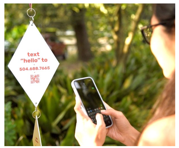
Talk Tree To Me - SMM

Let artists lead engagements around intersectional policy