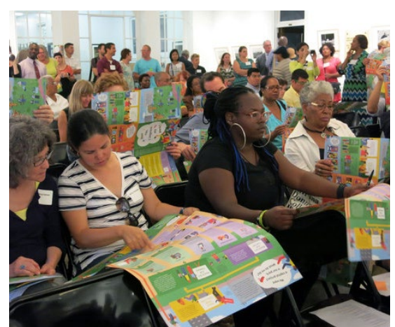
Making Policy Public - CUP

Infuse a spirit of play into our reflections on the future