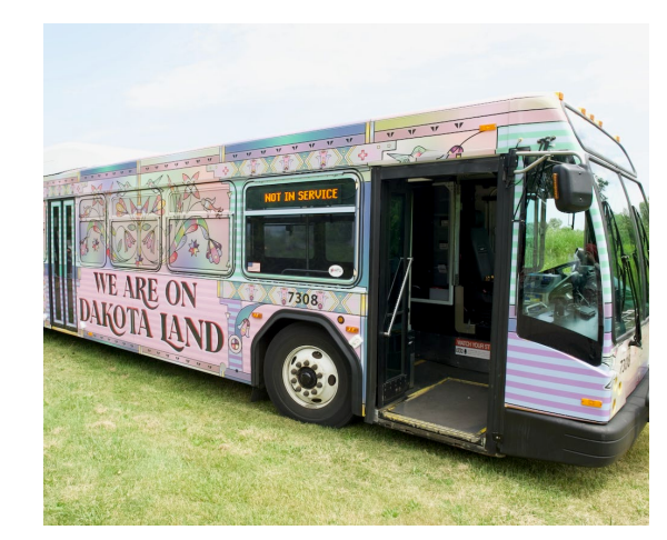
Dakota Land Map Bus - Marlena Myles