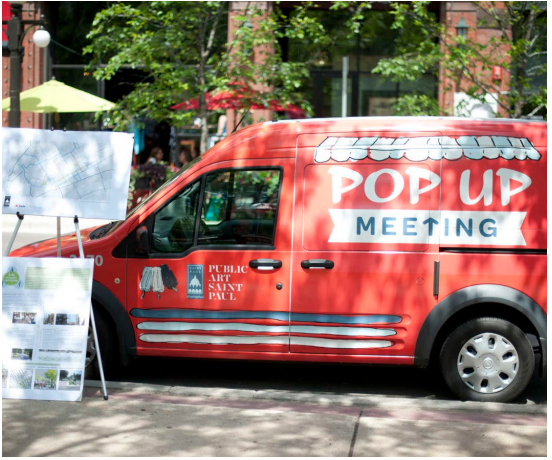
Pop Up Meeting - St Paul Public Art

Bring engagement to where people are at throughout the region