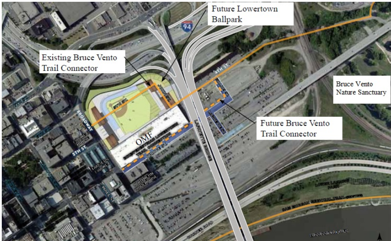
Figure 1: Bruce Vento Regional Trail Realignment Map

The Metropolitan Council has committed to dedicating right-of-way at no cost to the City of St. Paul for the construction of Willis Street, the northern portion of Prince Street and the regional trail realignment. The City of St. Paul acquired easements over three properties for the southern portion of Prince Street. Figure 2 shows the relationship between the regional trail and property ownership in the area. The area in yellow and labeled as 3 on Figure 2 is owned by the Metropolitan Council. The Green Line OMF is located on the portion of that property west of the Lafayette Bridge. The regional trail realignment is shown by the dashed black line on the south and east sides of the property.