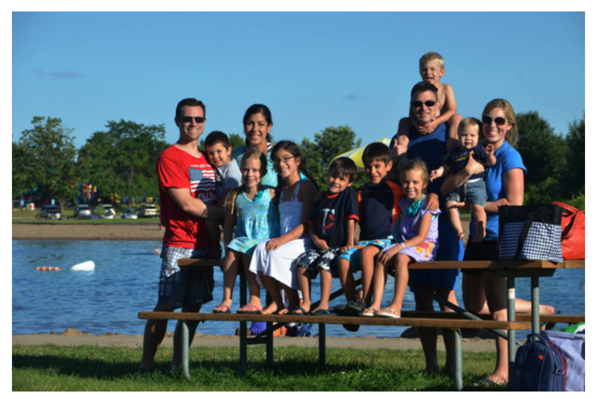
Lake Elmo Park Reserve— Washington County

Strengthen equitable usage of regional parks and trails by all our region's residents, such as across race, ethnicity, class, age, ability and immigrant status