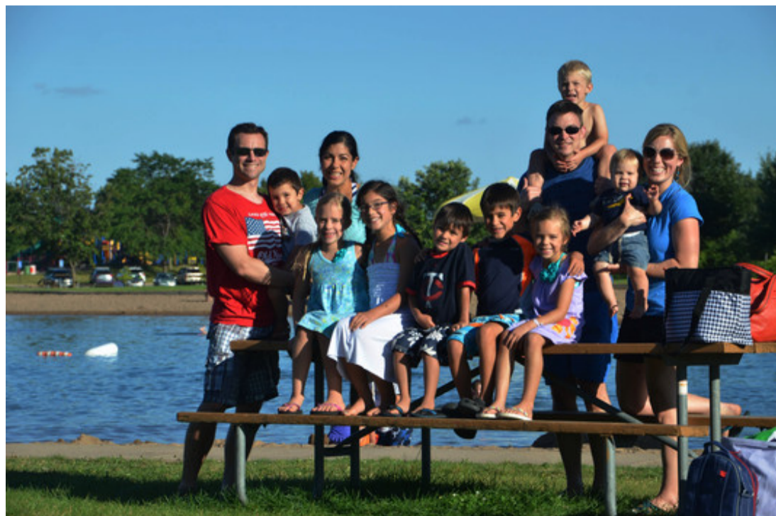
Lake Elmo Park Reserve— Washington County