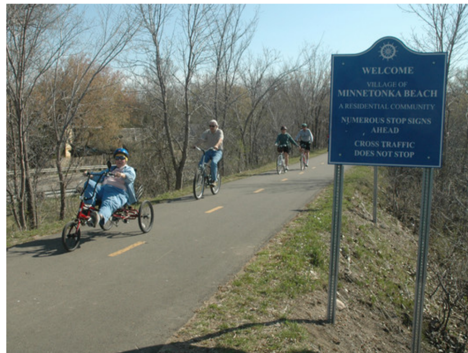
Dakota Rail Regional Trail— Three Rivers Park District