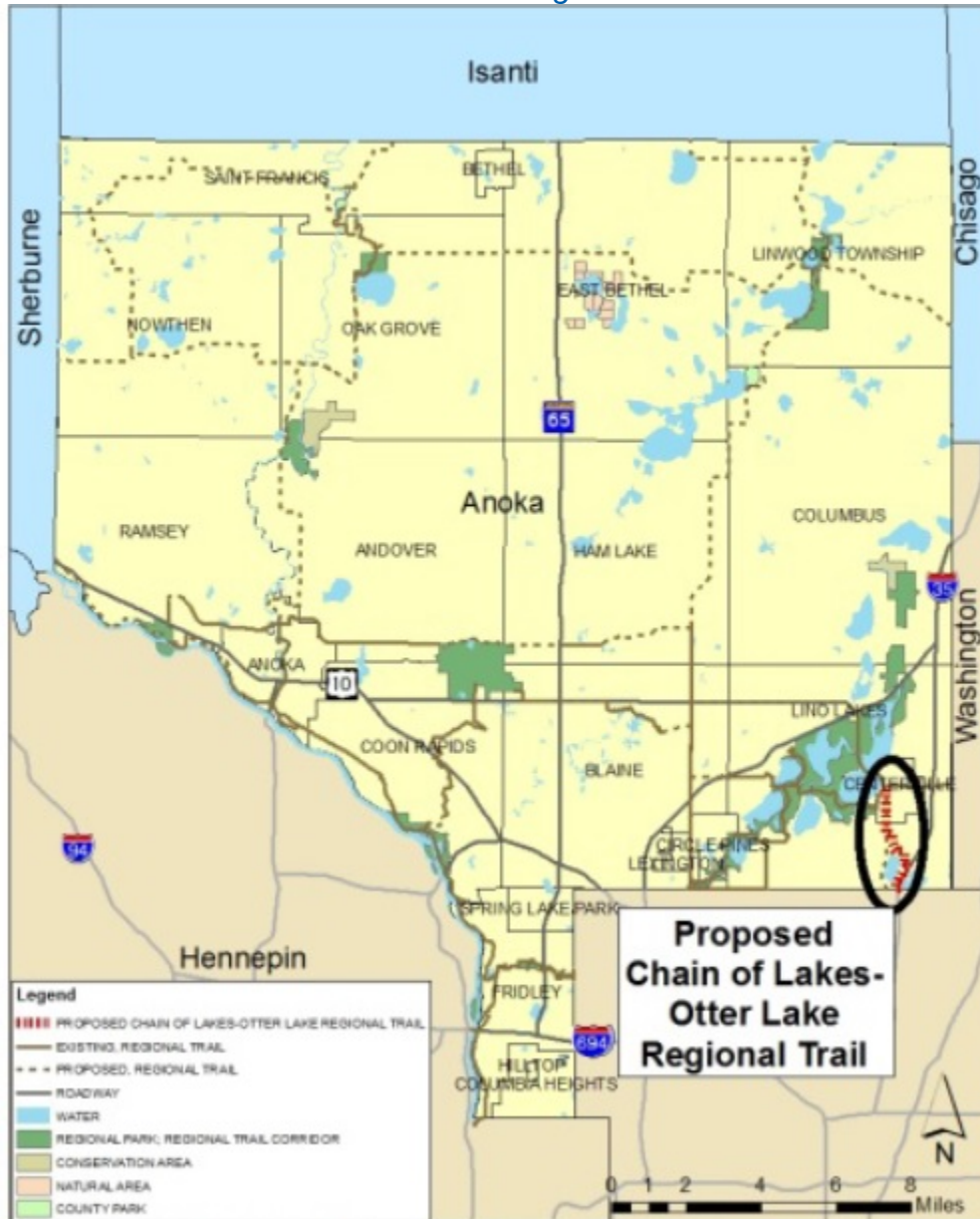
Figure 1: Location of Chain of Lakes-Otter Lake Regional Trail within Anoka County

The Chain of Lakes-Otter Lake Regional Trail will be located in the southeast portion of Anoka County, and will travel through the Cities of Centerville and Lino Lakes along its 3 mile route. Figure 1 shows the regional trail location with Anoka County and Figure 2 shows the planned alignment of the regional trail.