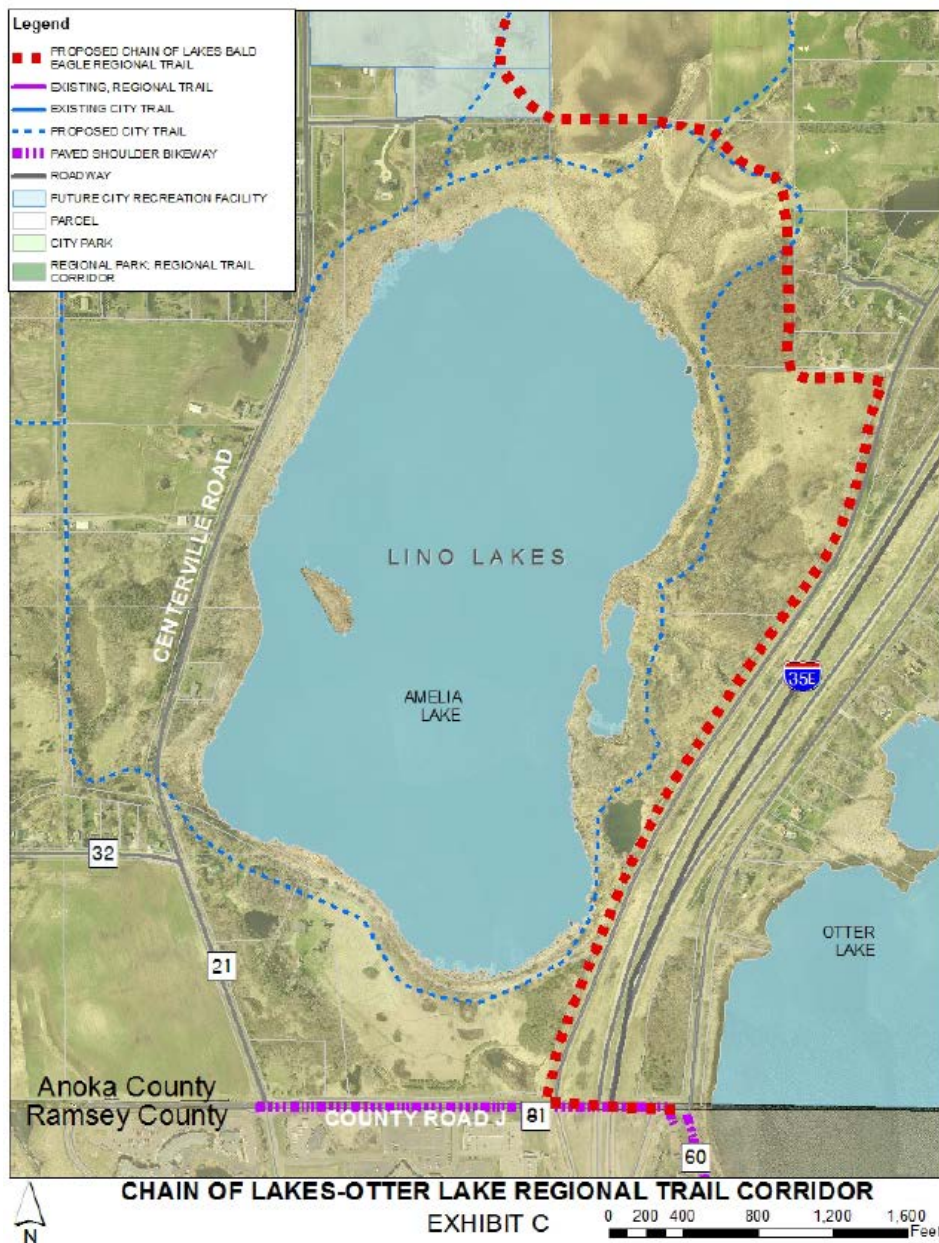
Figure 5: Southern Segment of Chain of Lakes-Otter Lake Regional Trail

Anoka County will be constructing a portion of the northern segment of the regional trail between Heritage and Dupre Streets in Centerville as part of a road reconstruction project in 2015. Any additional right-of-way needed for this segment of the regional trail will be acquired as part of the roadway project, and the County will not seek Regional Parks System funding for land acquisition.