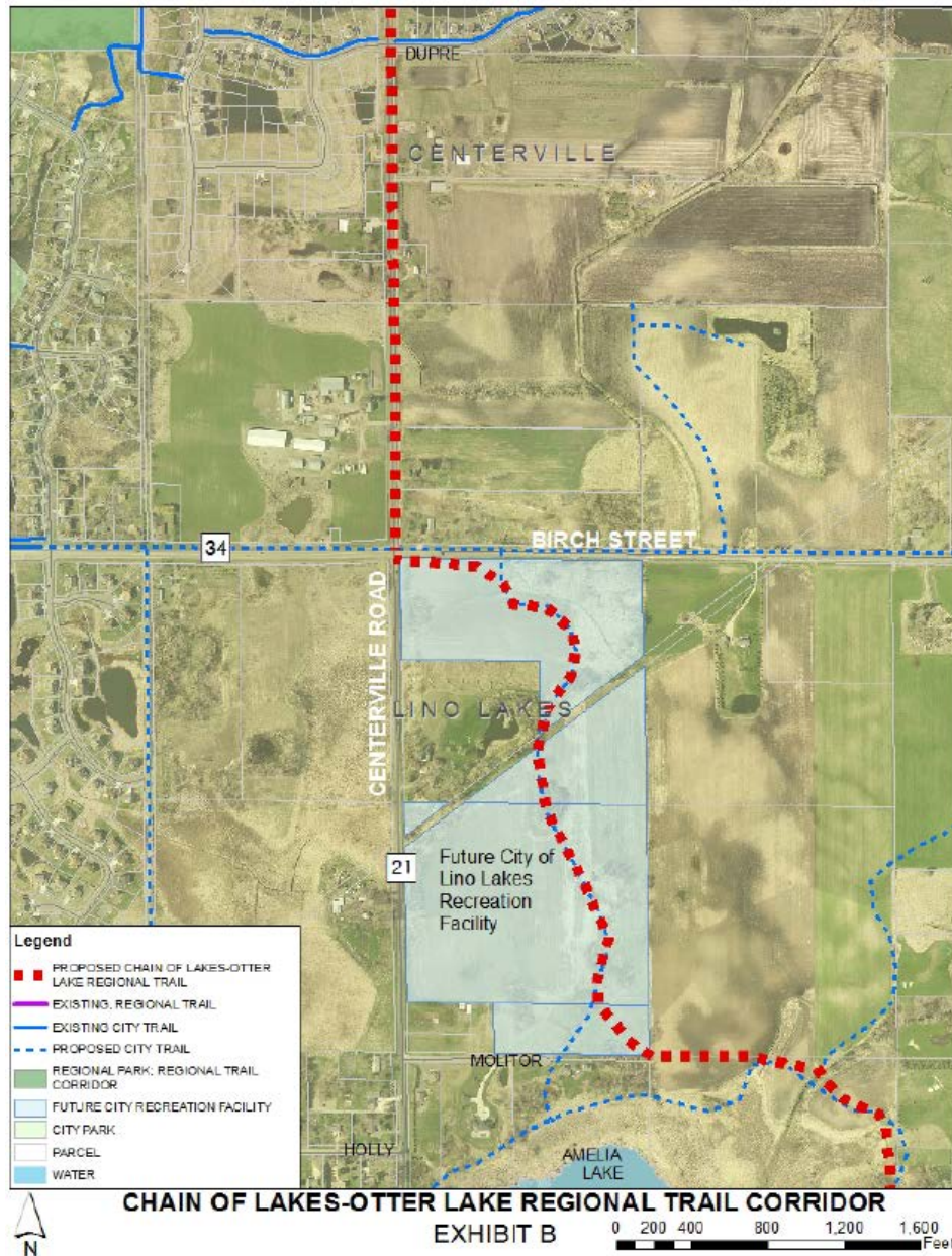
Figure 4: Central Segment of Chain of Lakes-Otter Lake Regional Trail

The southern segment of the regional trail will travel from the future Lino Lakes Recreation Facility to the west side of 20 th Avenue (CSAH 54), then to County Road J, across Interstate 35E, to Otter Lake Road at the border of Anoka and Ramsey Counties. The southern segment of the trail is shown in Figure 5. The regional trail will connect to a proposed local trail around Amelia Lake.