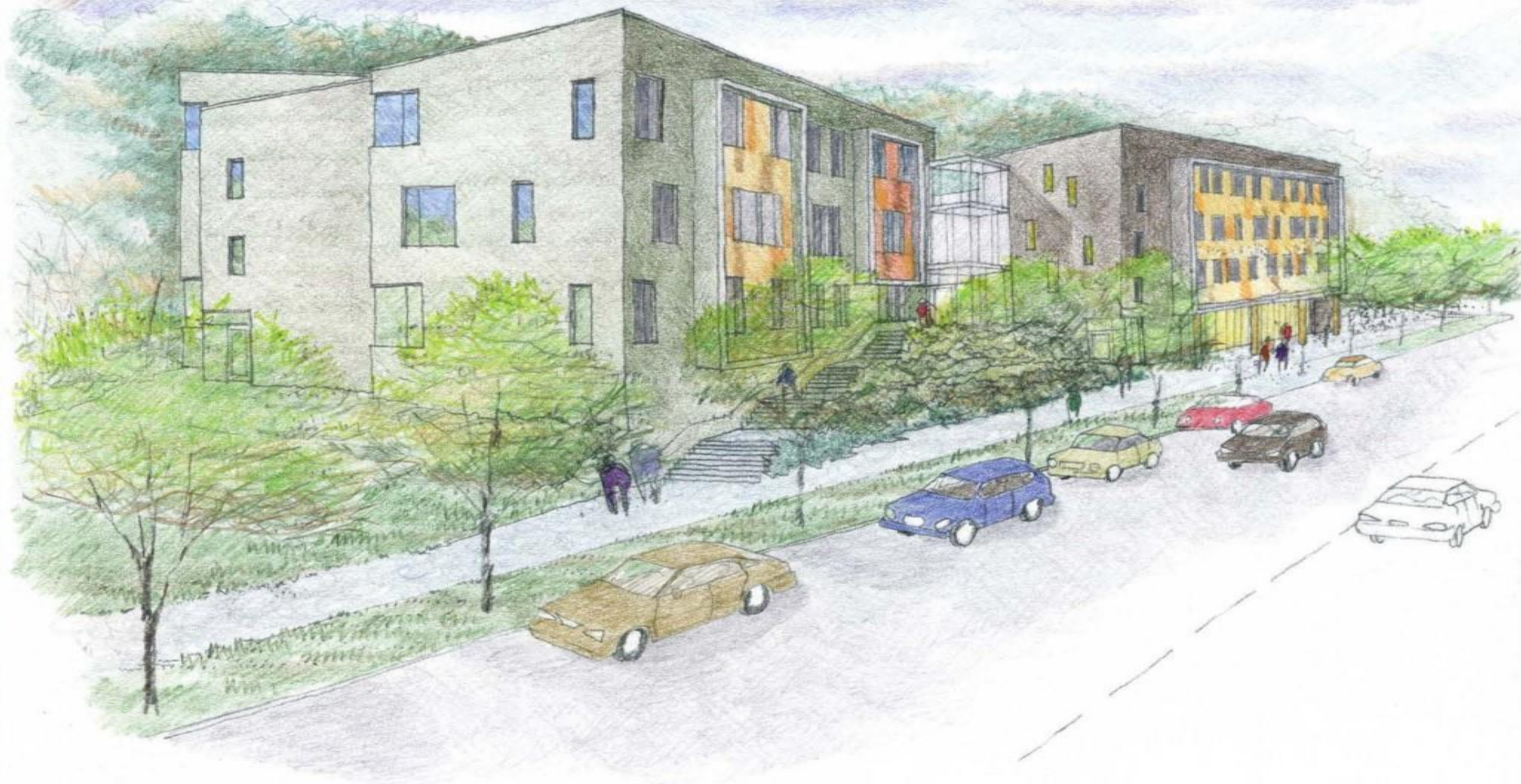
View of Proposed Development from East (Robert Street/Cesar Chavez intersection)