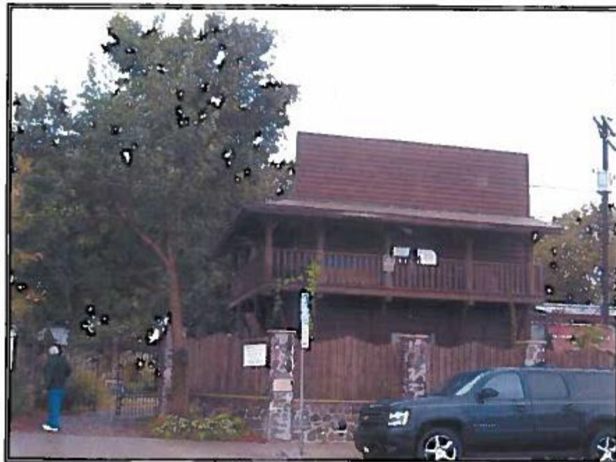
East side of the subject property on Marshall St.