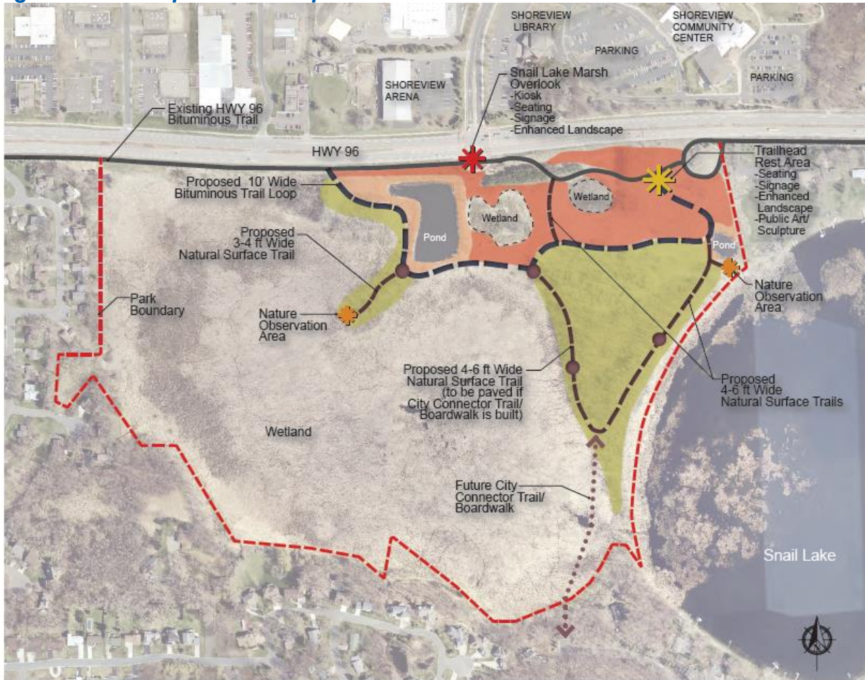
Figure 3: Development Concept for Snail Lake Marsh Amendment Area