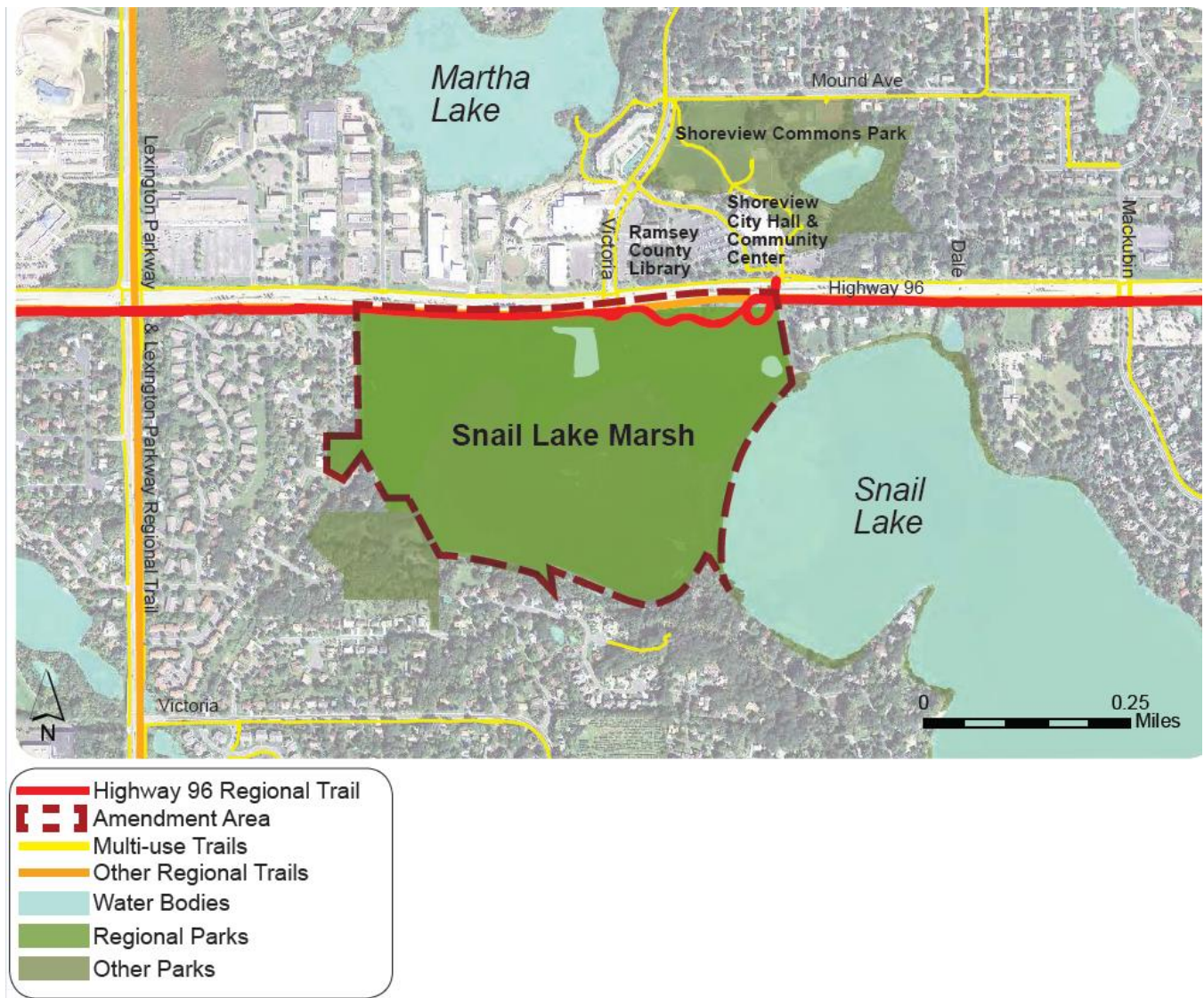
Figure 2: Snail Lake Marsh Overview