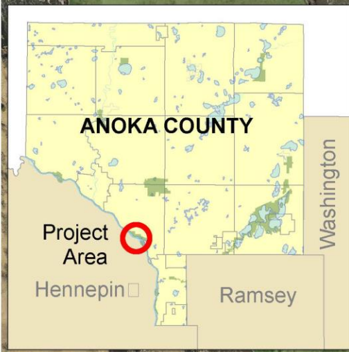
Coon Rapids Dam Regional Park