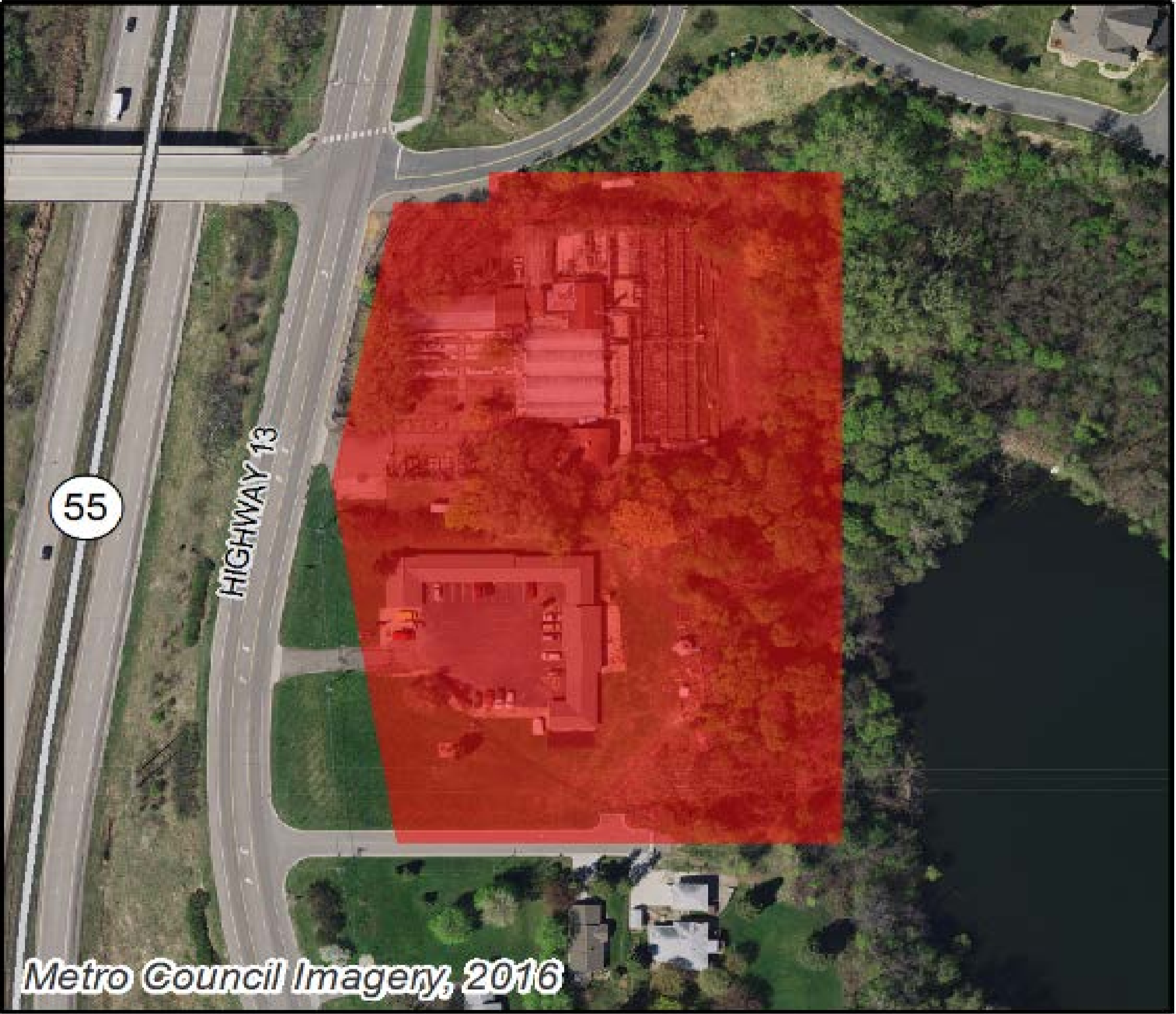
Metro Council Imagery, 2016