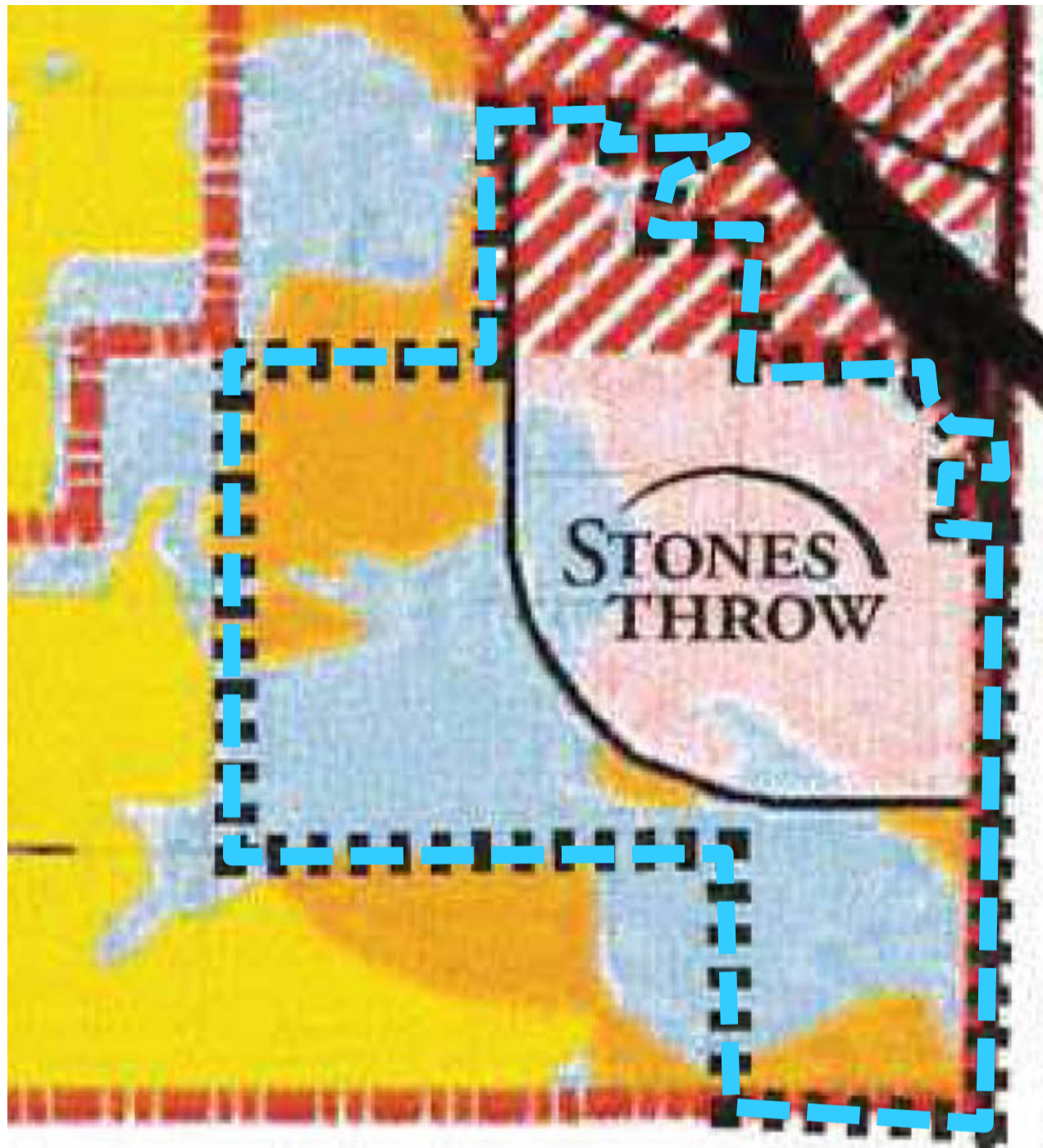
Current Planned Land Use