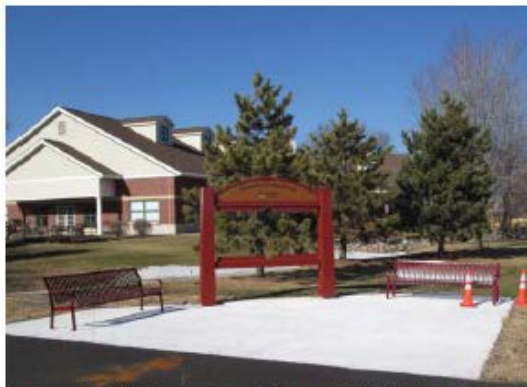
Hardwood Creek kiosk and rest stop.