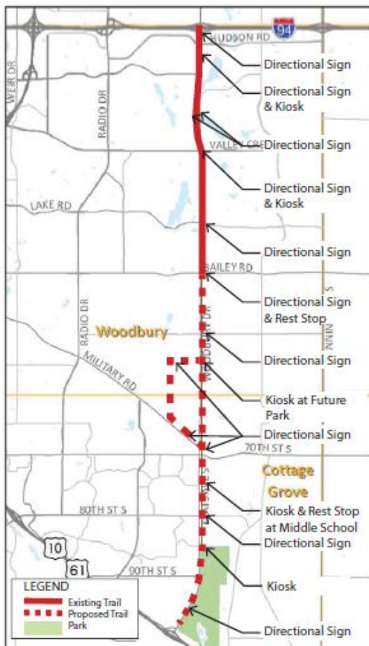
Figure 3: Wayfinding Location Map and Examples