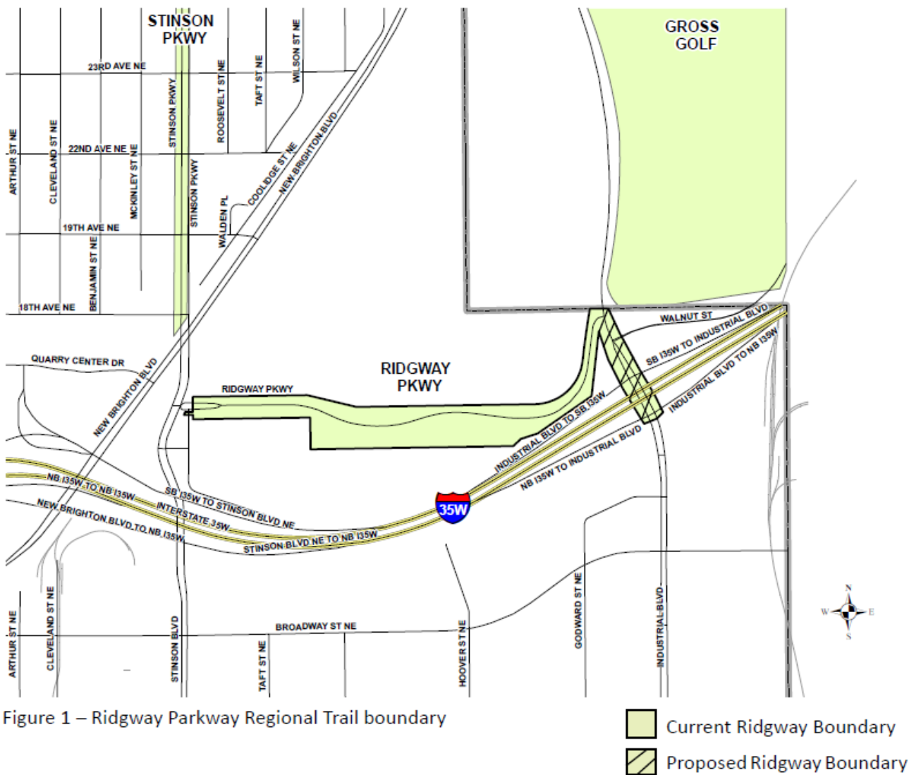
Figure 1 – Ridgway Parkway Regional Trail boundary