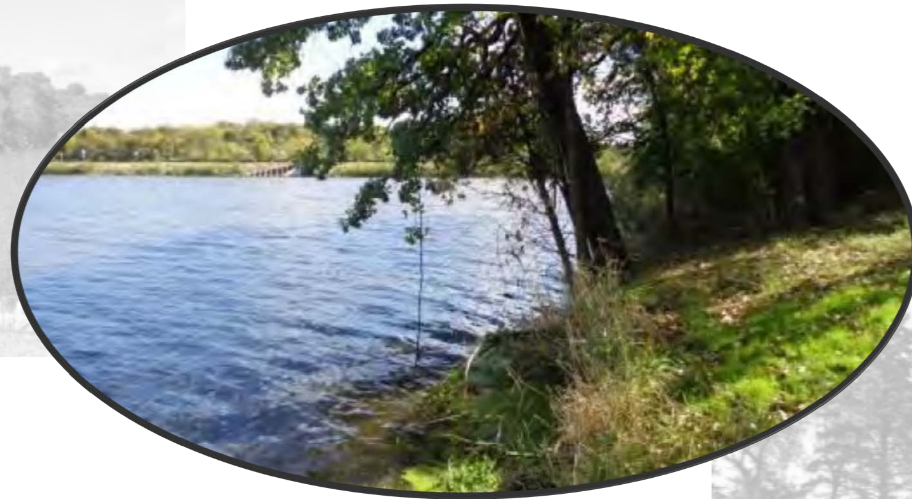
View of Mooers Lake