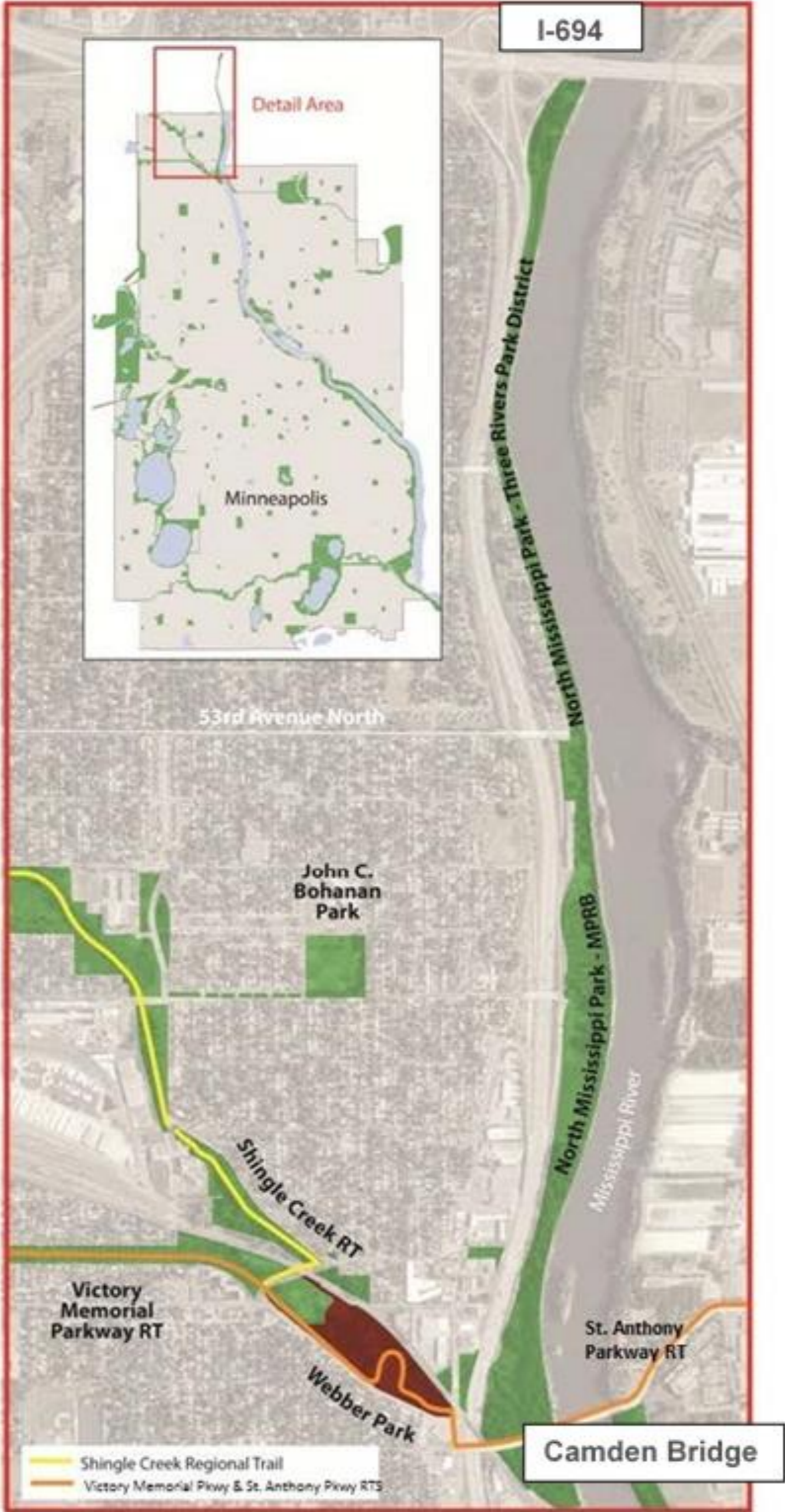
Webber Pool, MPRB, Jan 2018