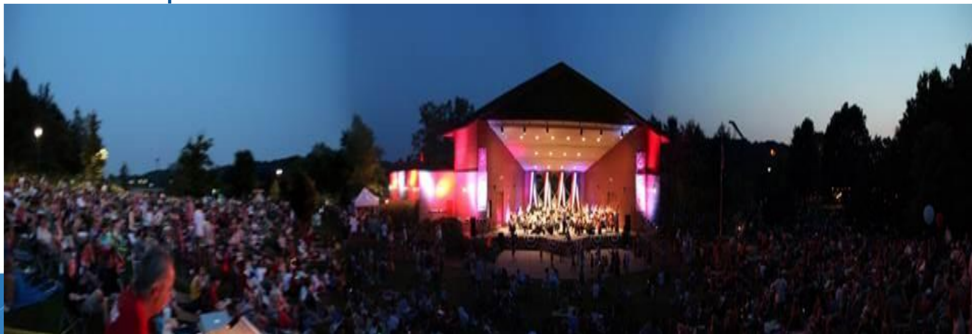
Fourth of July Celebration Normandale Lake Bandshell, Hyland-Bush-Anderson Lakes Park Reserve