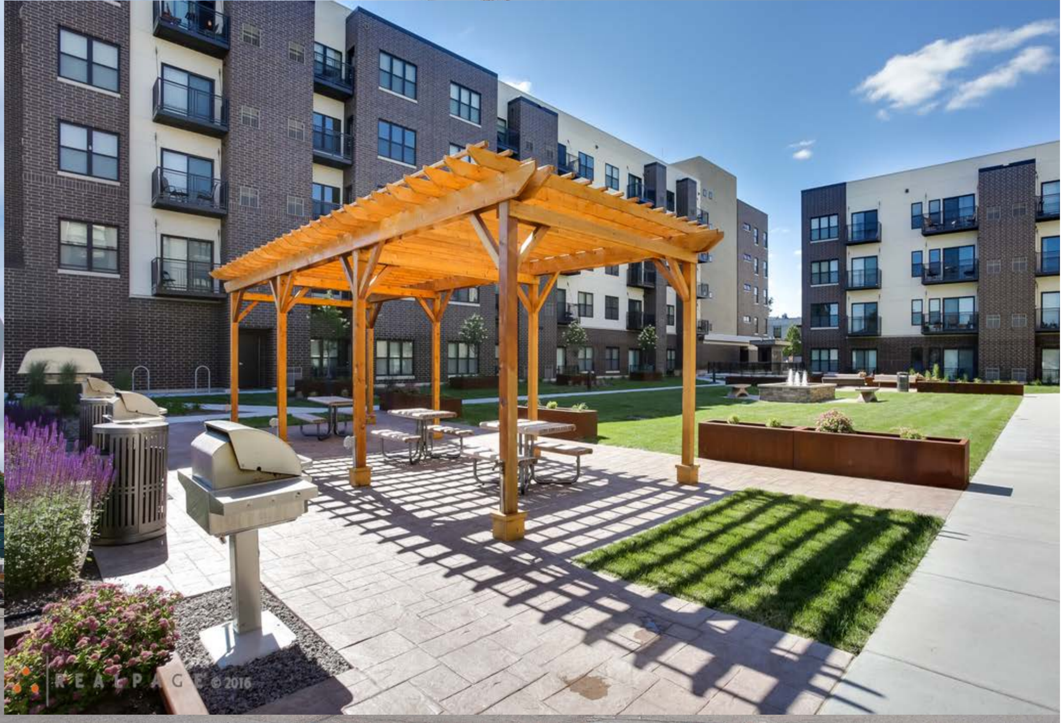
Gallery Flats, Hopkins