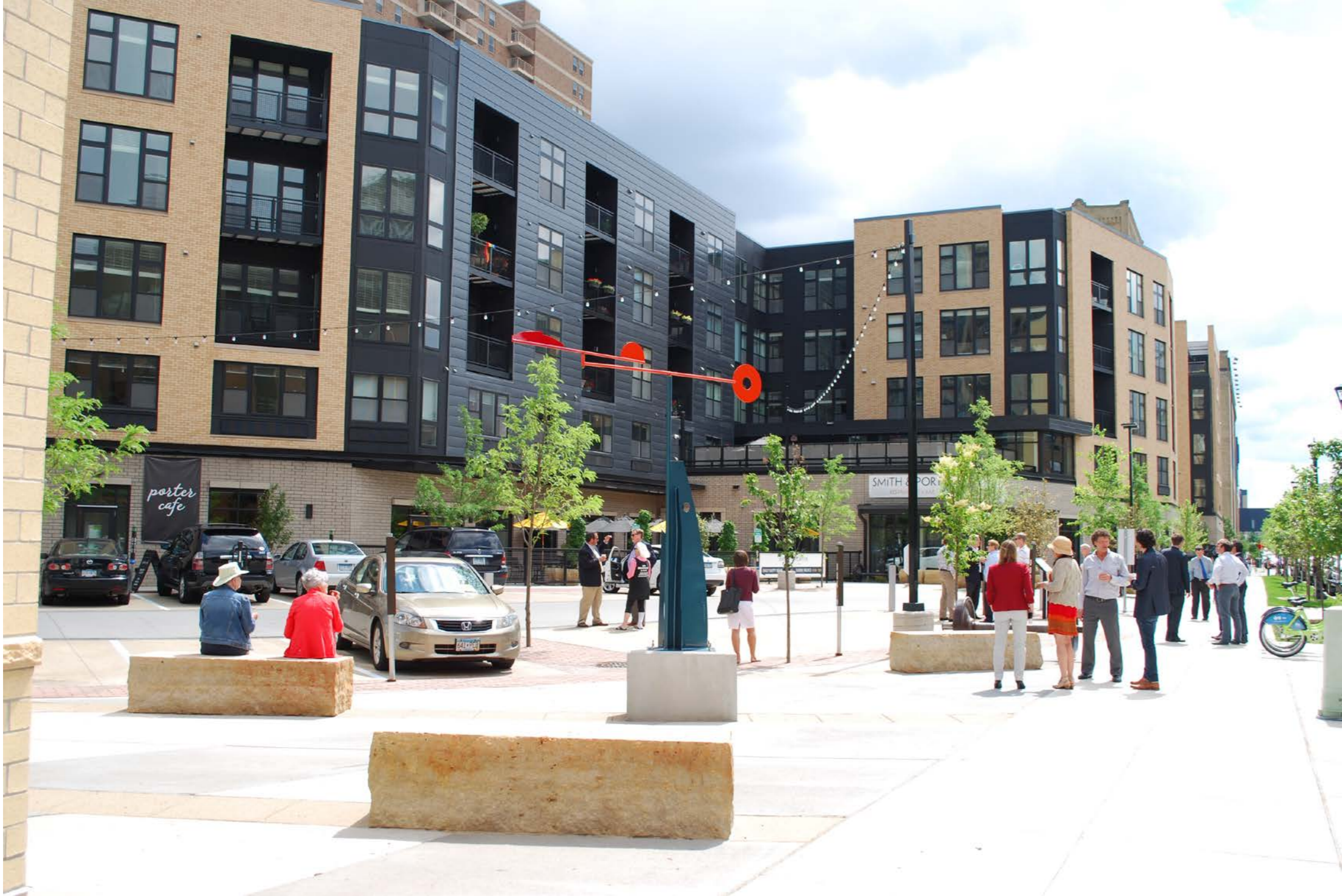
Mill City Quarter, Minneapolis