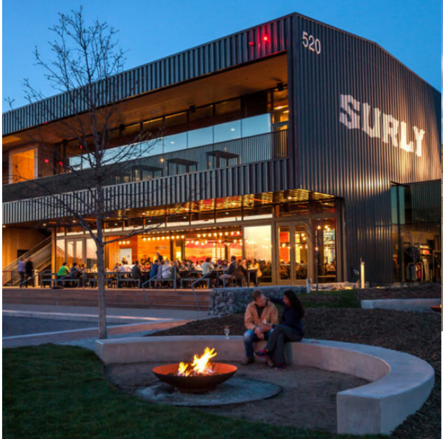
Surly Brewing, Minneapolis