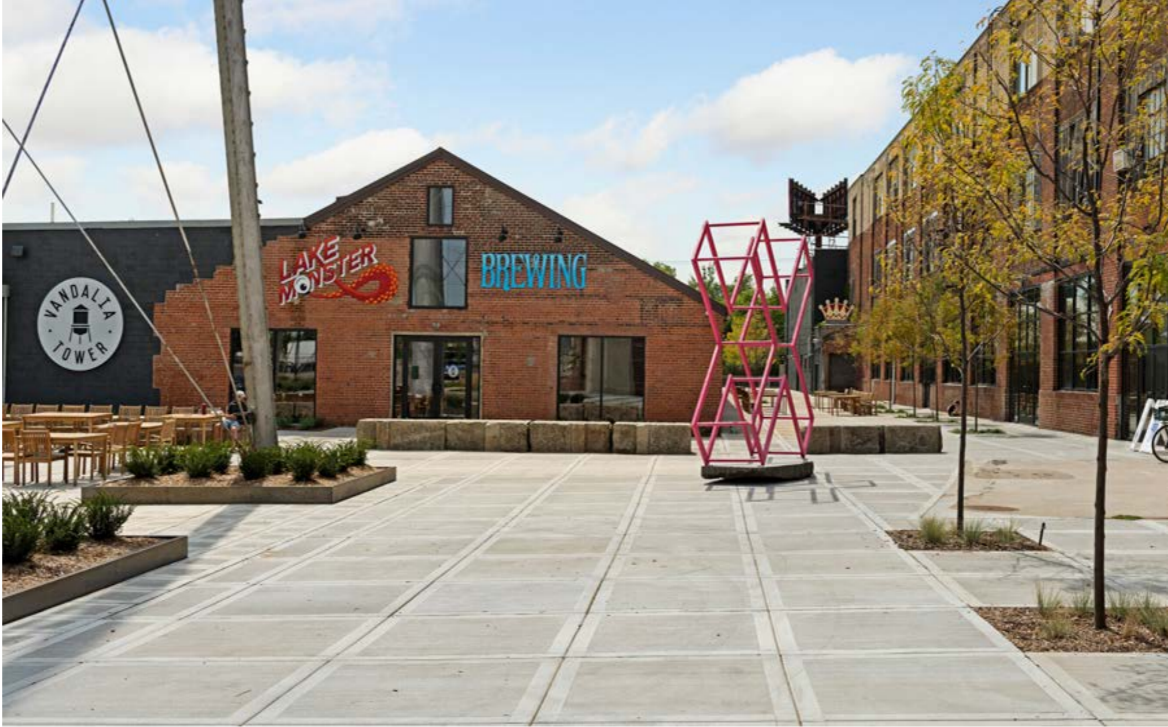
Vandalia Tower, Saint Paul