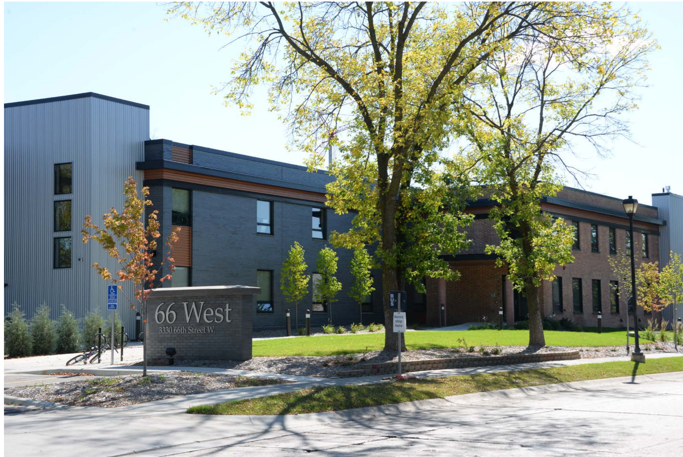
66 West, Edina