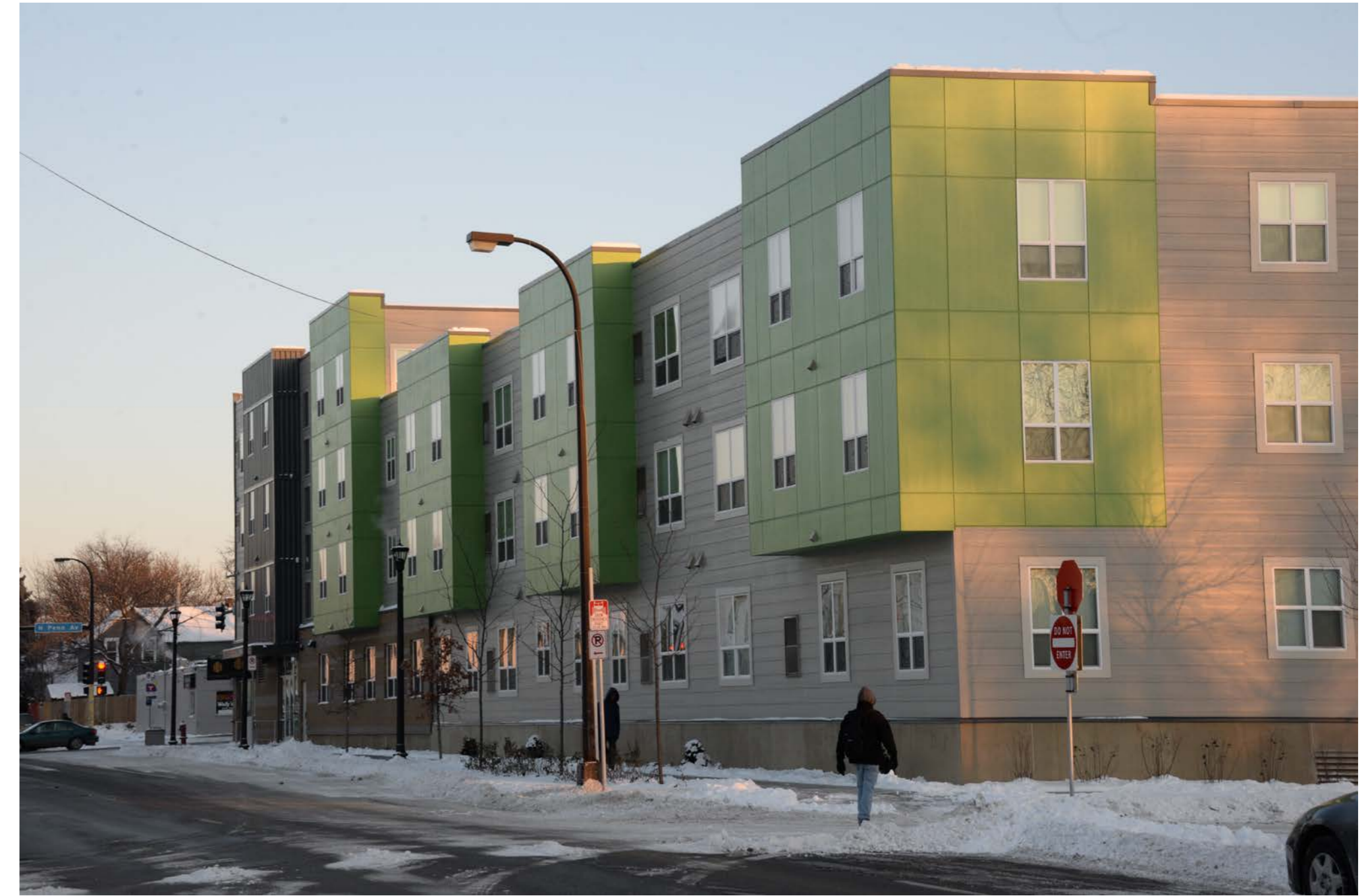
Commons @ Penn, Minneapolis