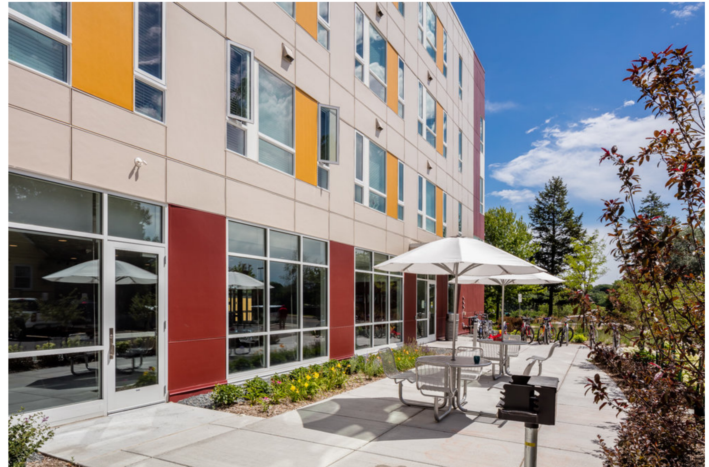
Clare Terrace, Robbinsdale