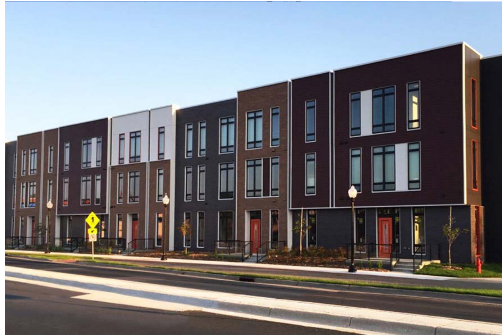
Artspace Hastings River Lofts, Hastings