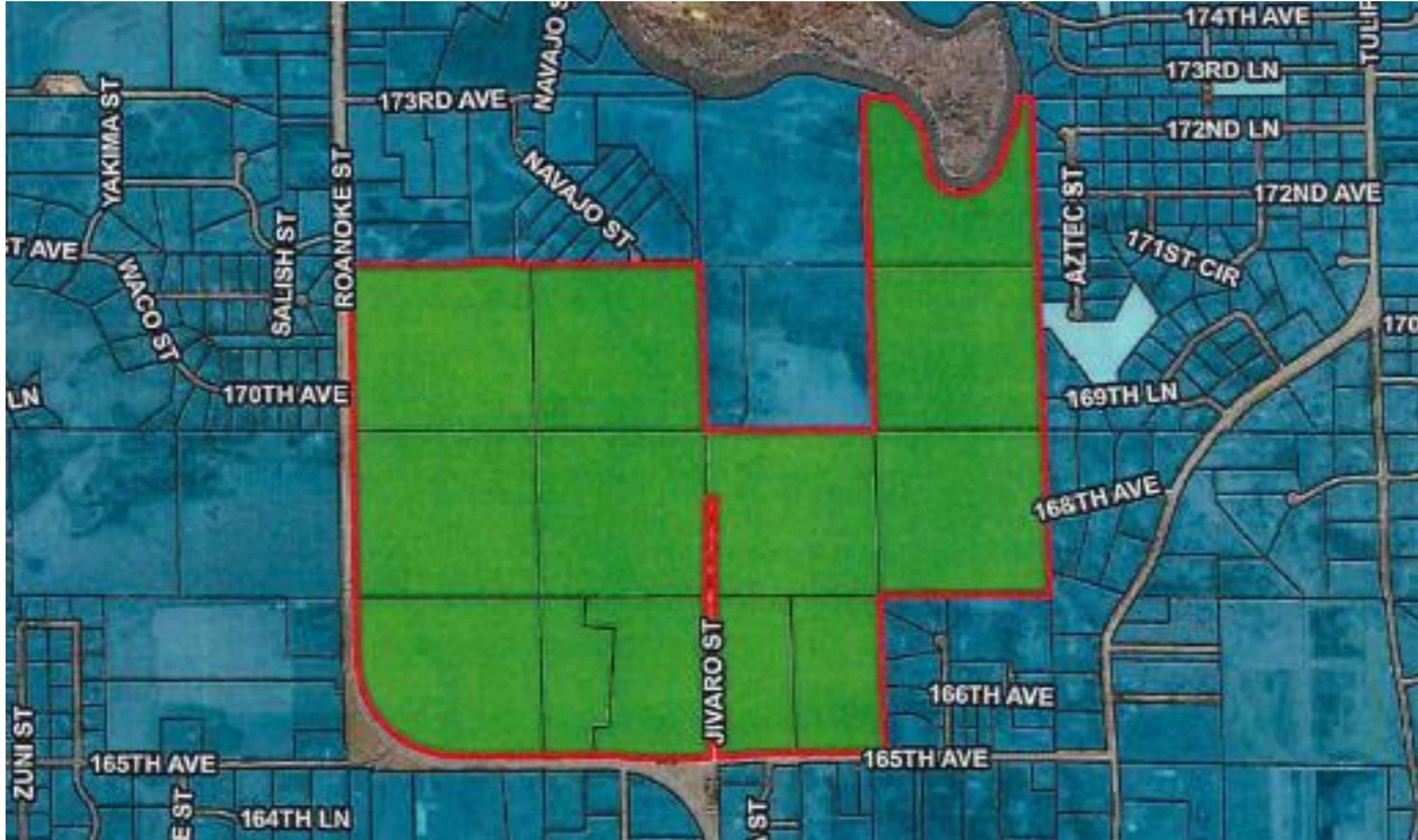
Current Guiding Land Use