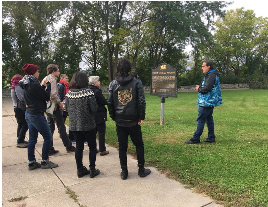
Signage in Indian Mounds Regional Park is being updated to reflect cultural plan

Reflect your policy values? Increase equitable use of Regional Parks and Trails? What strengths and challenges?