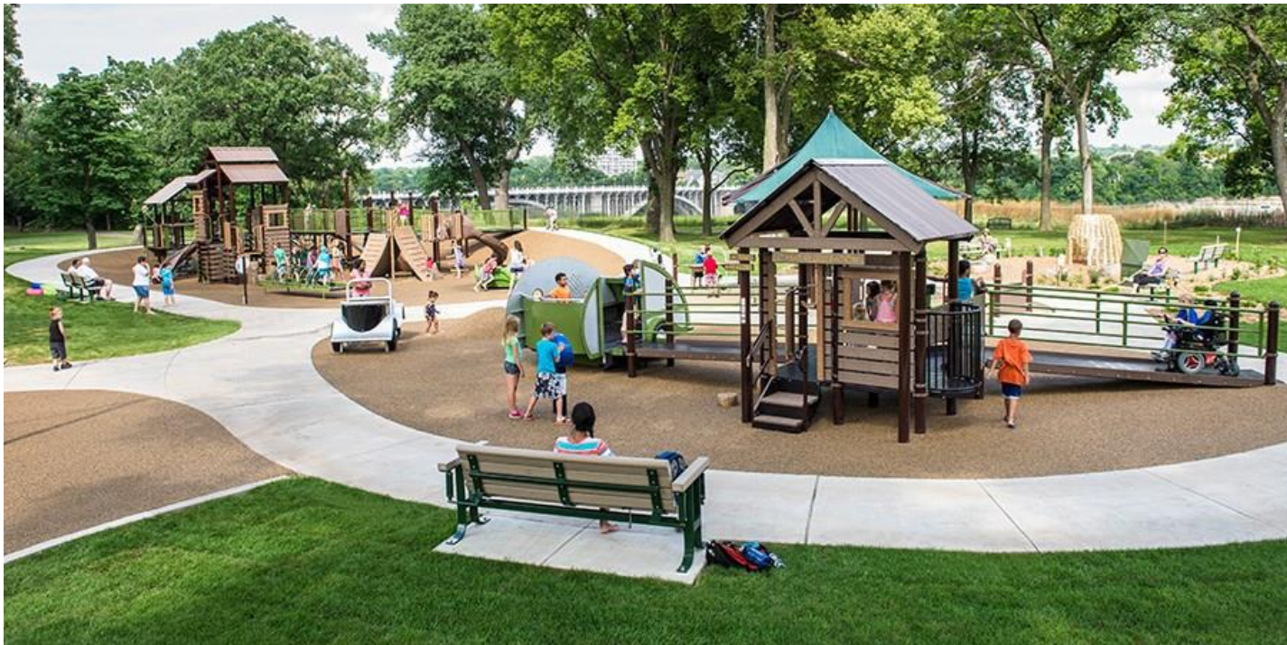
Universal access playground at Wabun Picnic Area

Reflect your policy values? Increase equitable use of Regional Parks and Trails? What strengths and challenges?