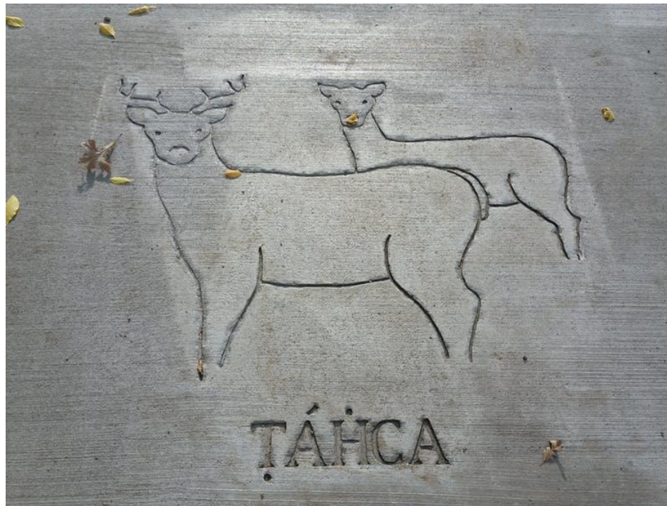
Angela Two Stars' Dakota language stamp in Bde Maka Ska sidewalk

Reflect your policy values? Increase equitable use of Regional Parks and Trails? What strengths and challenges?