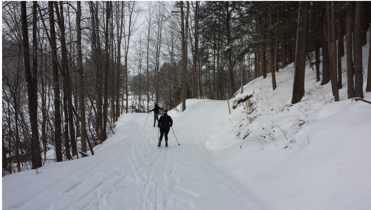
Increasing opportunities for winter recreation activities across all communities.

Reflect your policy values? Increase equitable use of Regional Parks and Trails? What strengths and challenges?