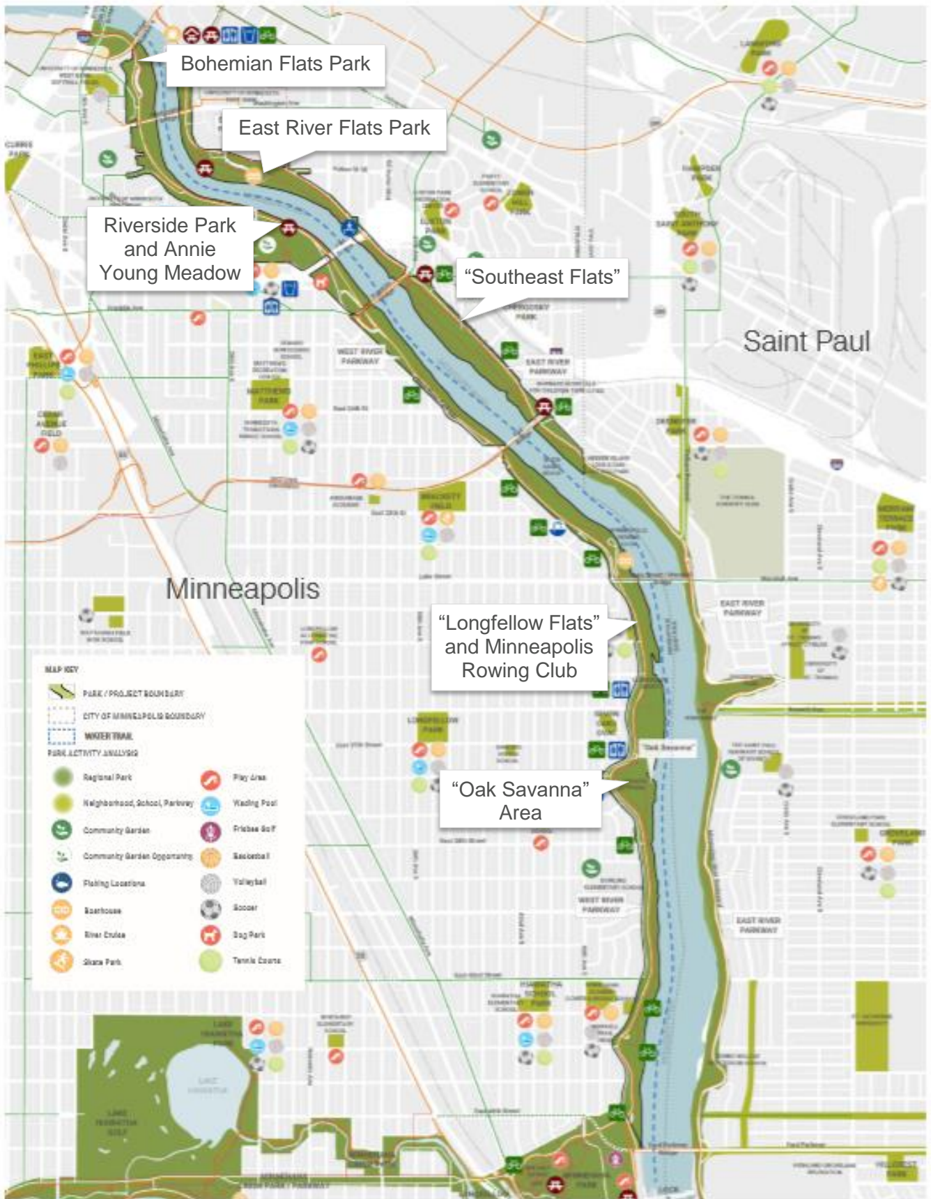
Figure 3: Parks, Trails and Open Spaces (MP Fig. 2-2)