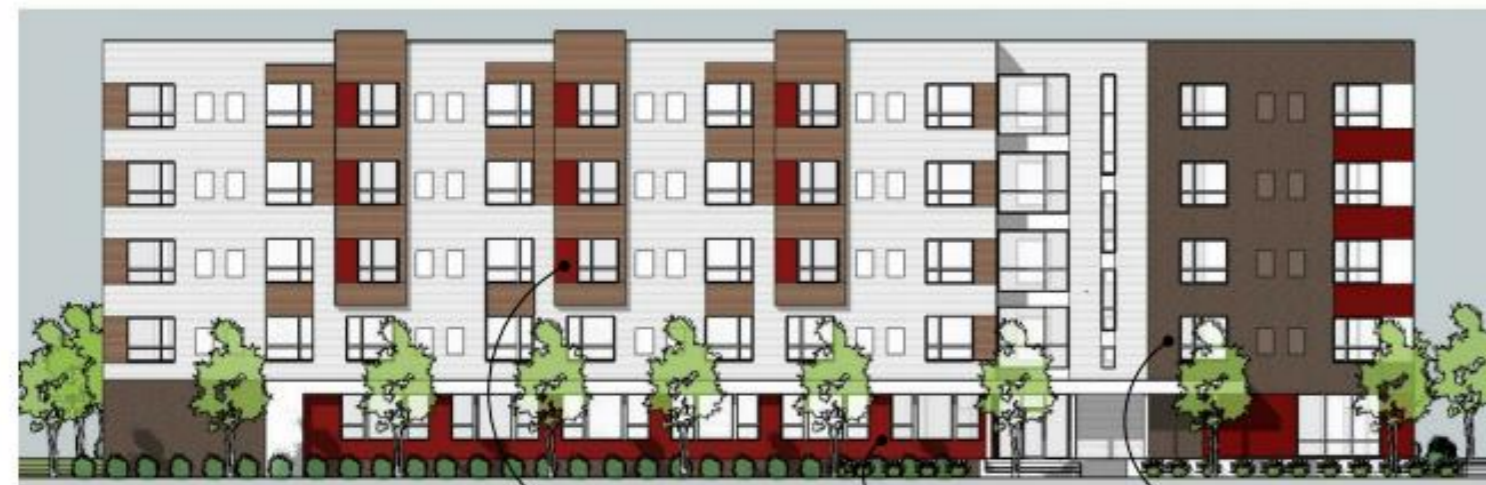
WEST ELEVATION / HIAWATHA AVE