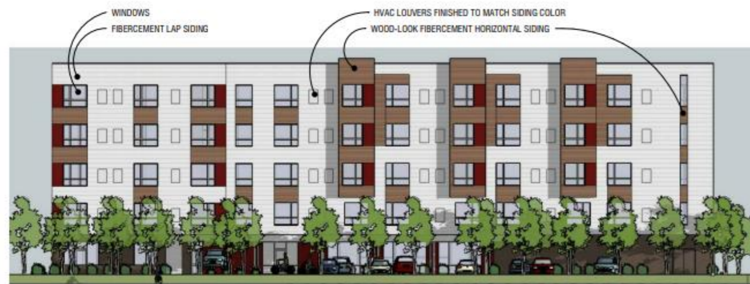
EAST ELEVATION / REAR YARD