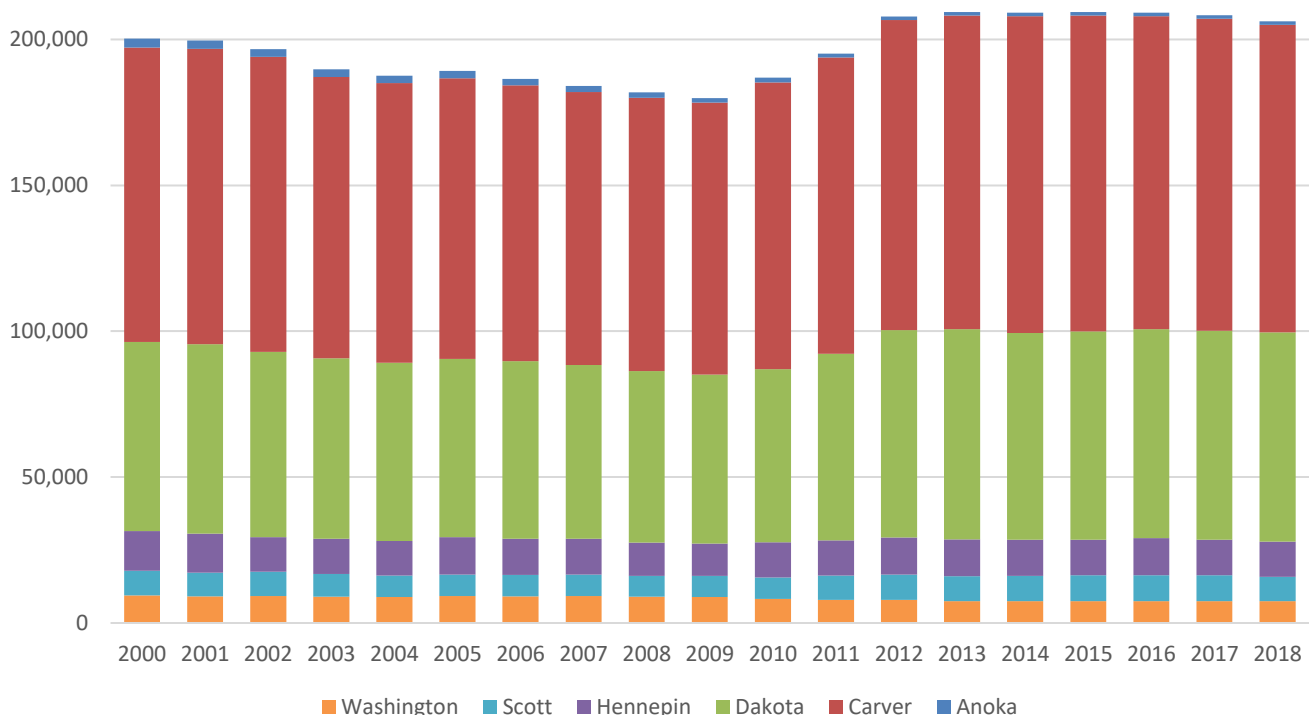
Figure 1- 2000 to 2018 Enrollment Trends (acres) by County

Table 1 shows the enrollment trends between 2000 and 2009, prior to the economic downturn. During this period, all counties experienced a decline in acres enrolled in the program. This decrease is consistent with the growing outward pressure that the region saw with development at that time. Table 2 shows the trends since 2009, after market recovery. Dakota County has seen the most substantial increase with almost 14,000 acres (24%) added to enrollments. Similarly, the number of acres enrolled have increased in Carver, Scott, and Hennepin counties, with over 12,000; 1,100; and 900 acres respectively. Anoka and Washington counties experienced a steady decline in the program since 2000, with overall 60% and 21% decreases respectively. This trend is consistent with development proposals in these counties. Ramsey County does not have any properties enrolled in the program since it is fully developed.