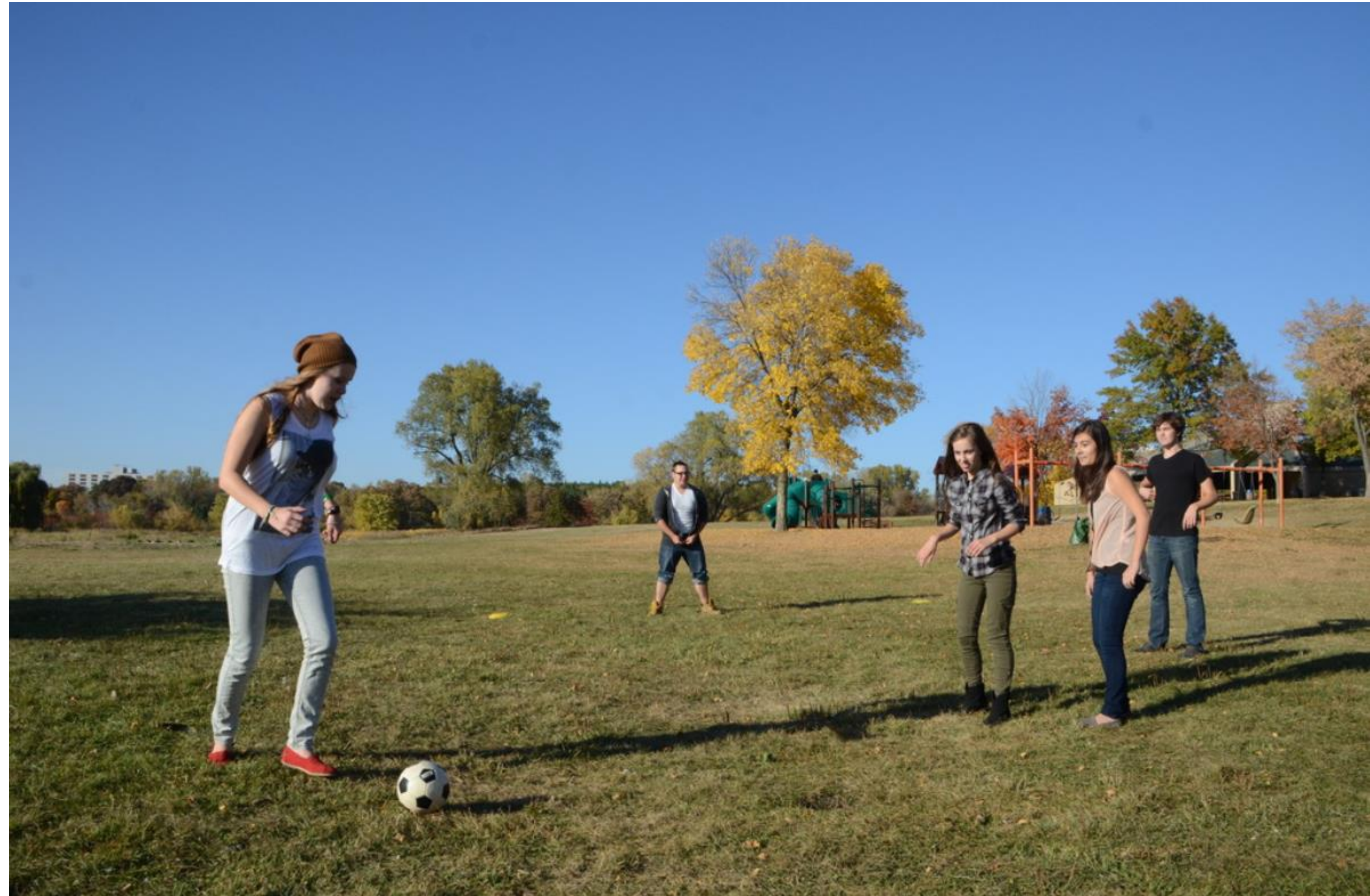
Teens play soccer at Battle Creek - Indian Mounds Regional Park in St. Paul and Maplewood.