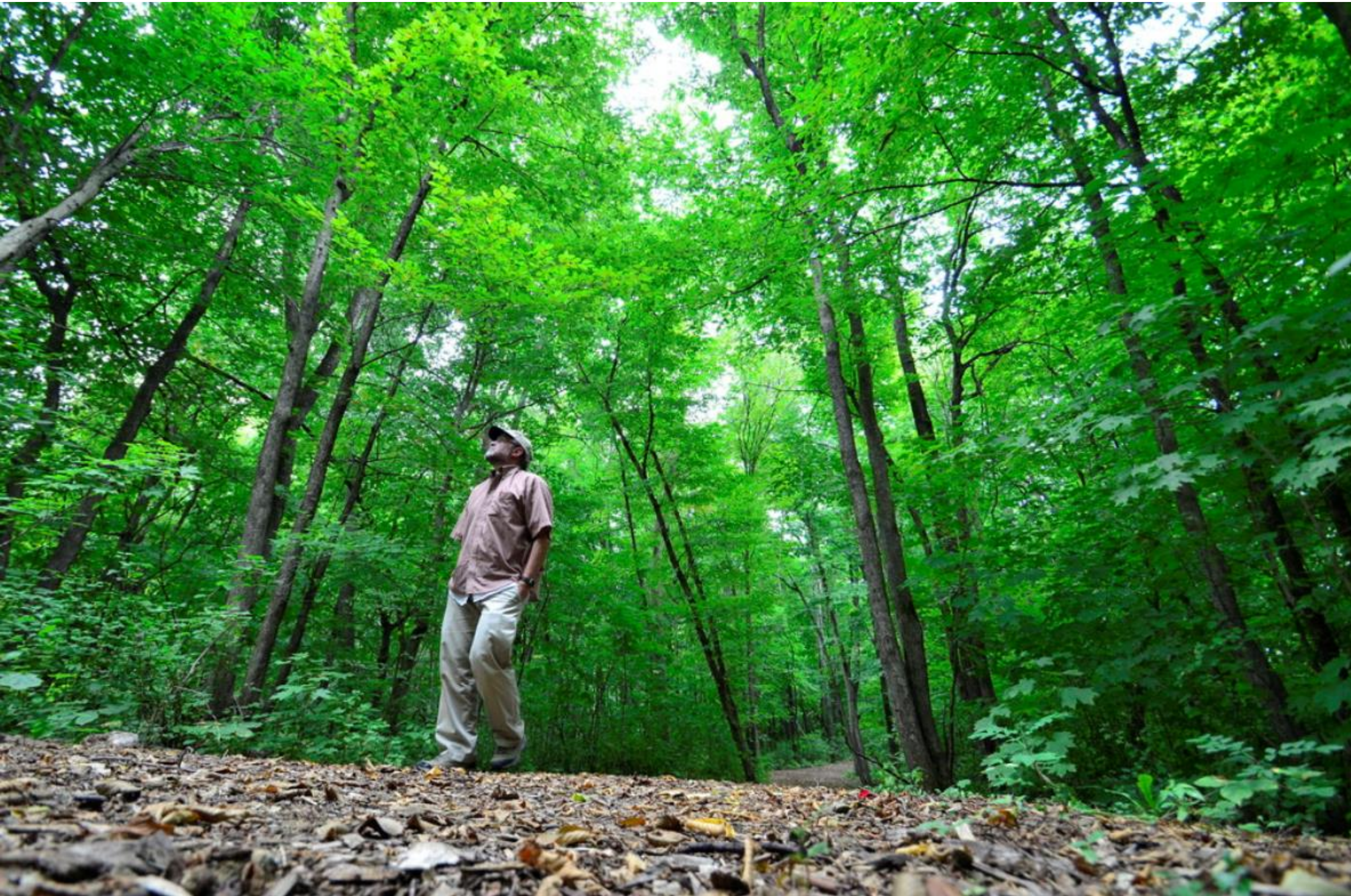
Man on trail at Elm Creek Regional Park Reserve.