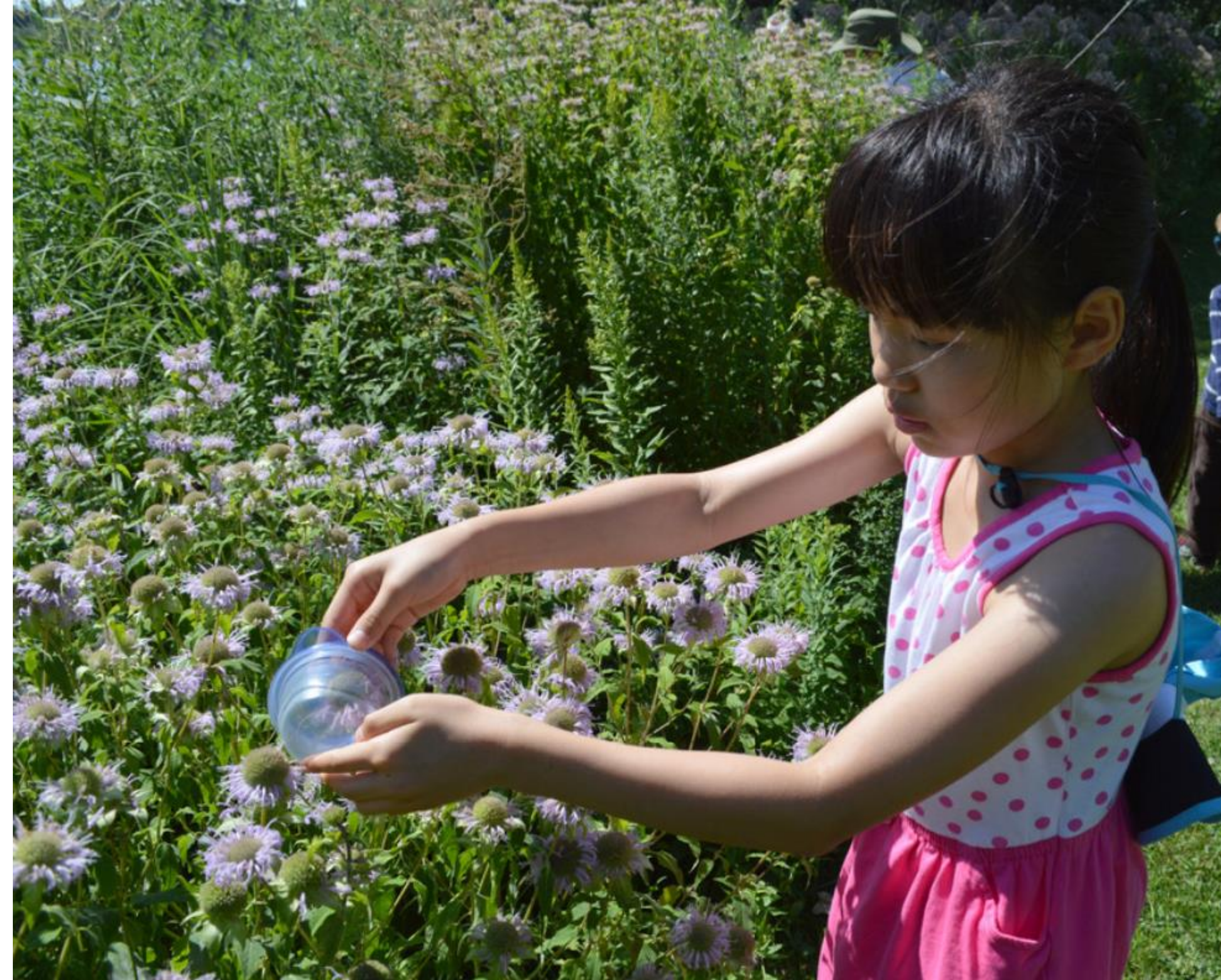
Girl helps with bee survey during a joint Saint Paul Parks & Recreation/U of M program.