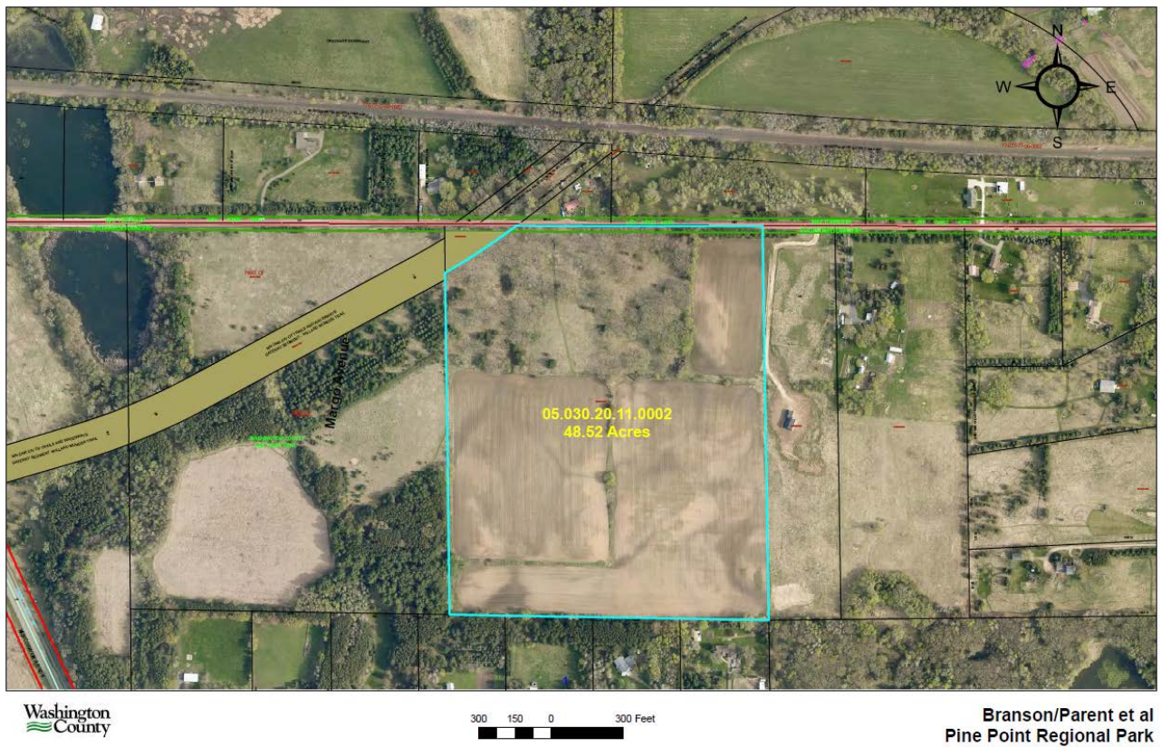
Figure 2. Aerial image of the Branson property