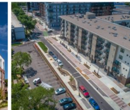
The ARtery, Hopkins