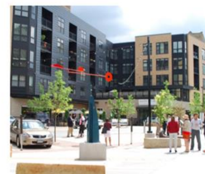
Mill City Quarter, Minneapolis