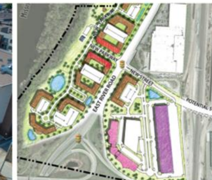
Northstar TIF Masterplan, Fridley