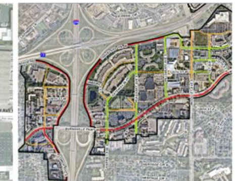
TOD Zoning Ordinance, Burnsville