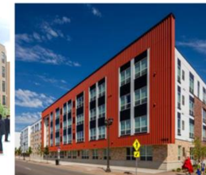
Hamline Station, St. Paul