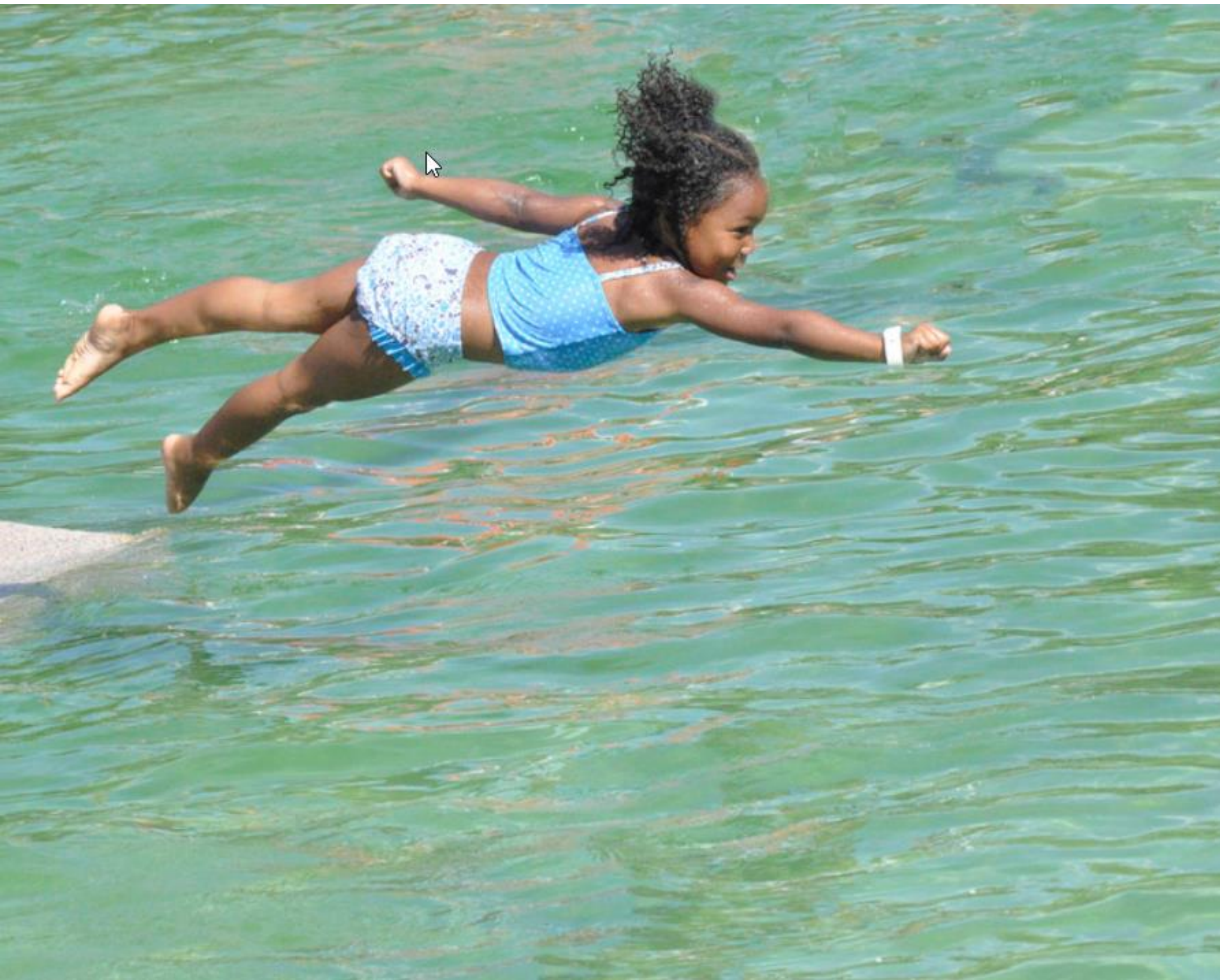
"Supergirl" jumps into Webber Park Pool, the nation's first outdoor natural-filtration swimming pool, in North Mississippi Regional Park, Minneapolis.

"Telling histories is meaningful. Then when visitors come, they know what land they're standing on, what it means to stand there, and who is connected to the land. When we visit a park, we want to know about all the events that happened there and how the land has changed."