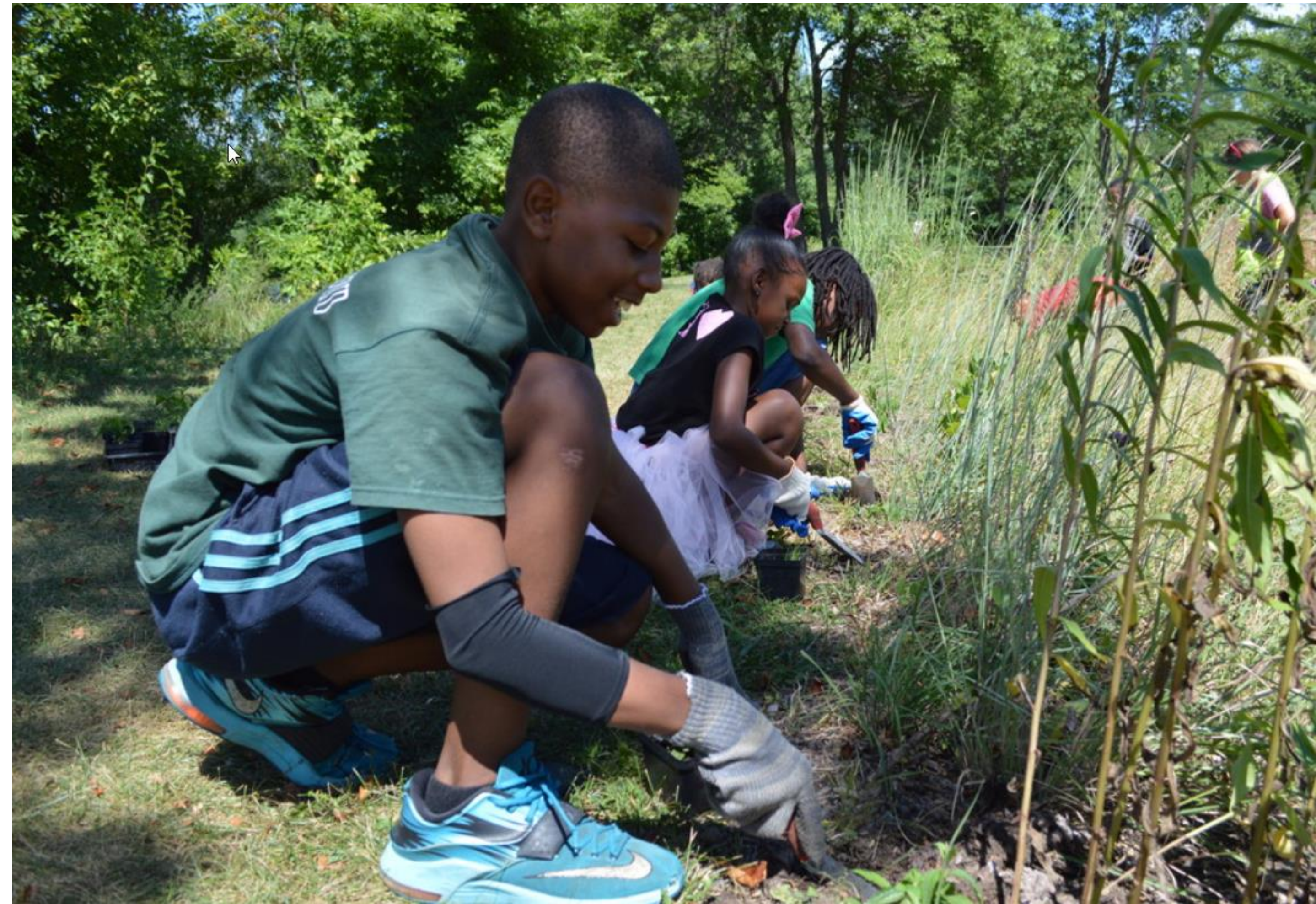
Children help plant a rain garden through the Saint Paul Parks & Recreation sPARK program.