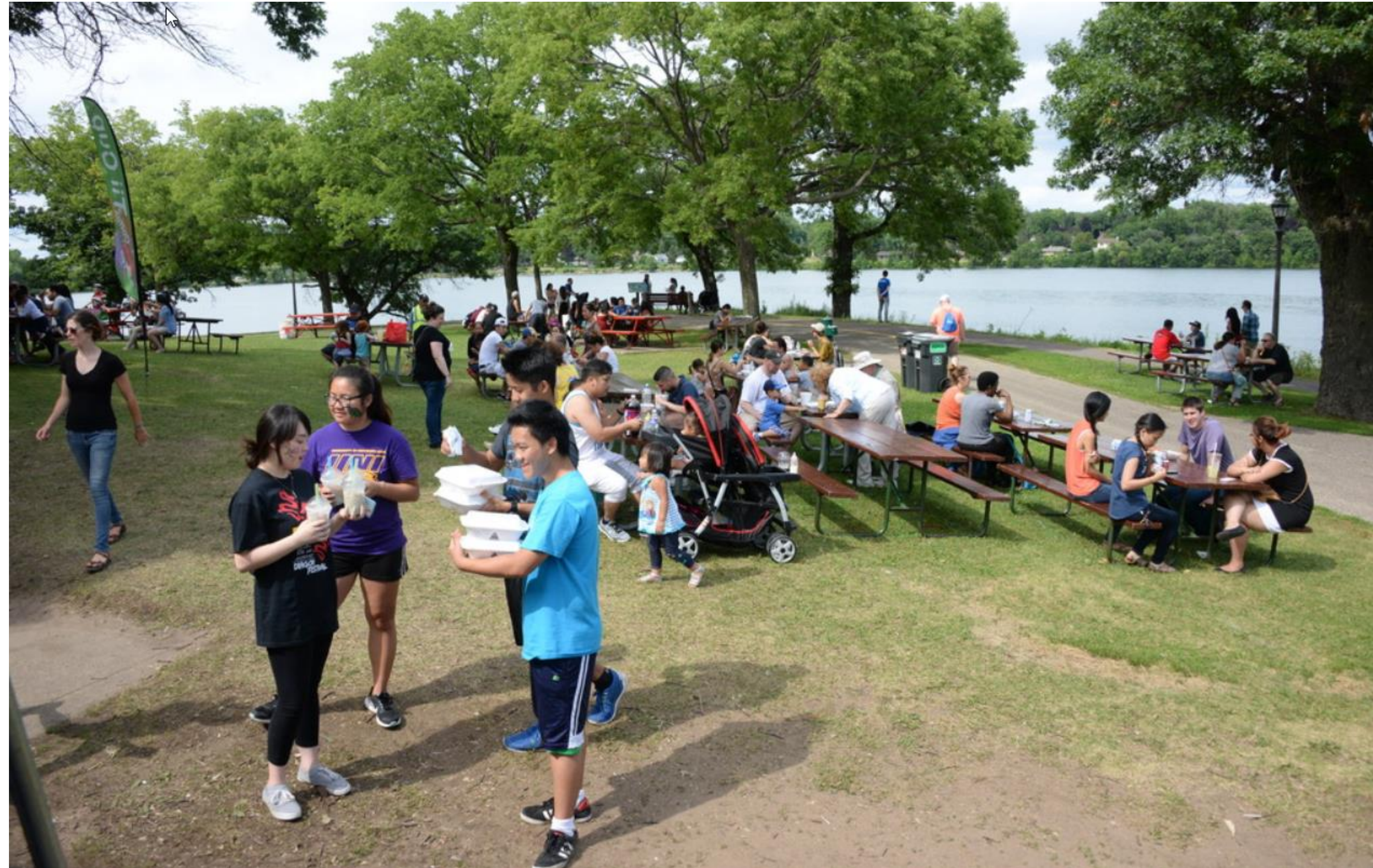
People picnic during the Dragon Festival at Lake Phalen Regional Park in Saint Paul. The annual event brings together diverse Asian communities in the region.