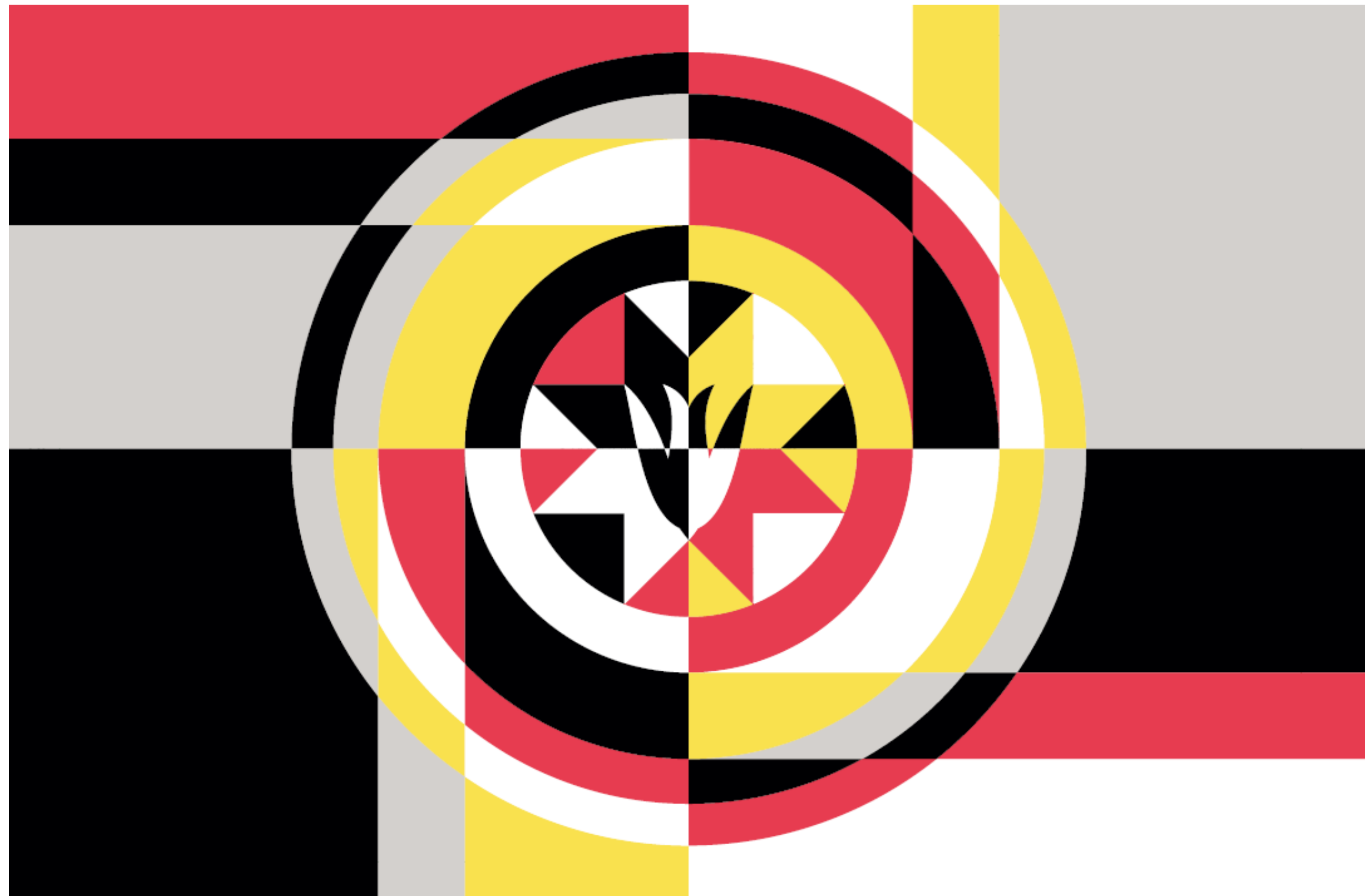
Flag design by Marlana Myles

What does a welcoming and inclusive Regional Parks System look like?