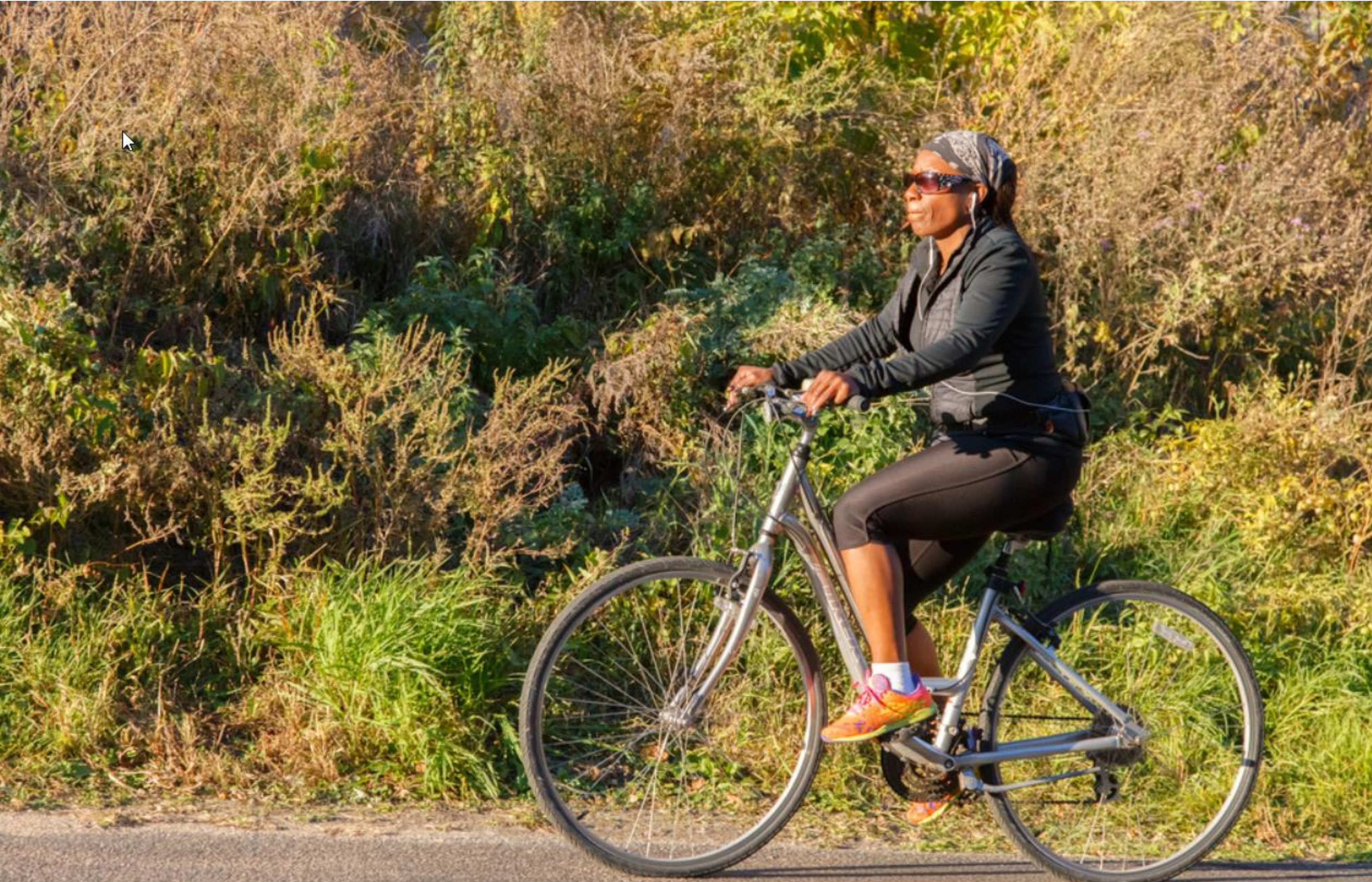
Cyclist on the Midtown Greenway in Minneapolis.