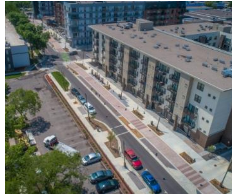
The ARTery, Hopkins