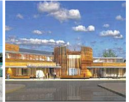
Minneapolis American Indian Center, Minneapolis