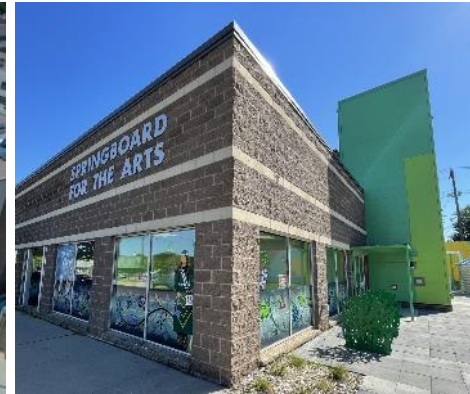
Springboard for the Arts, St. Paul