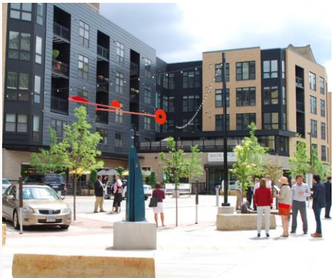
Mill City Quarter, Minneapolis