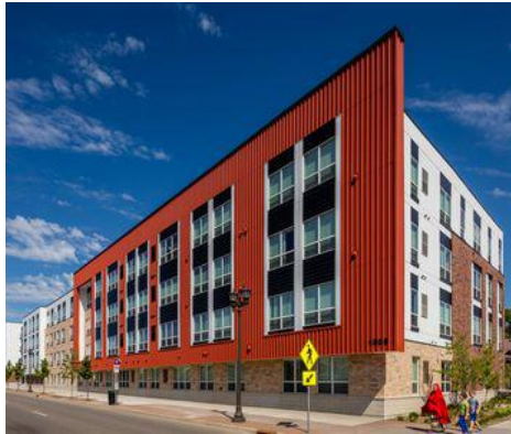
Hamline Station, St. Paul